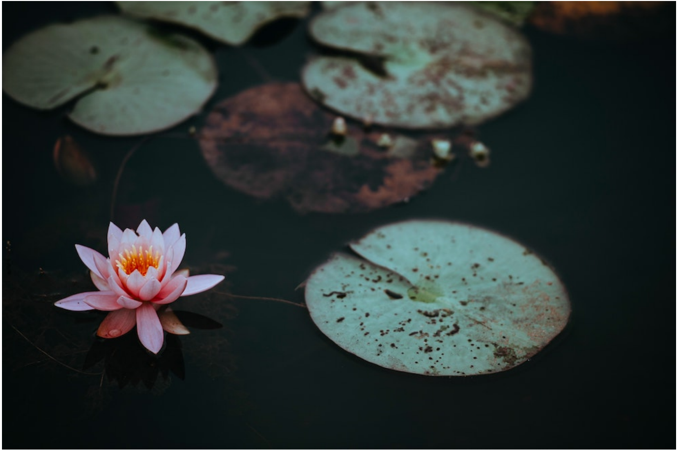
Lotus flower