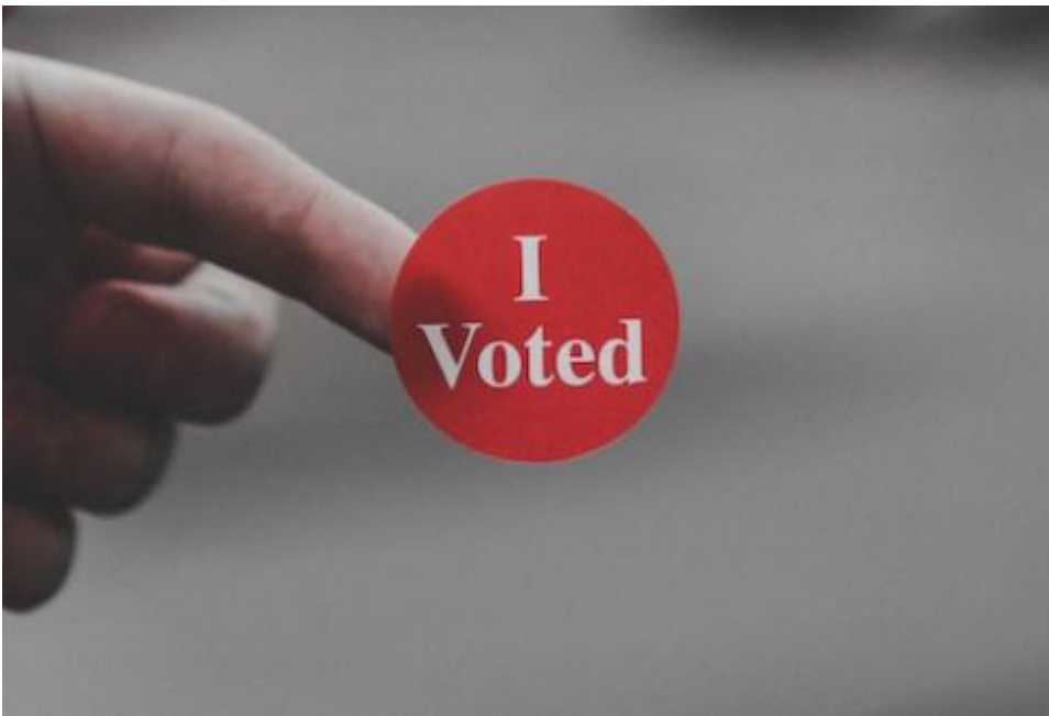
"I voted" sticker

Four years later, our political climate is both frostier and on fire. Yet I am even more convinced that the biggest need is for us to answer this question about hope, across political, and even church, divides.