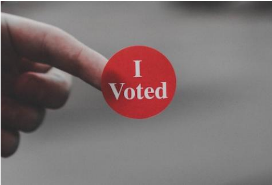
"I voted" sticker

Four years later, our political climate is both frostier and on fire. Yet I am even more convinced that the biggest need is for us to answer this question about hope, across political, and even church, divides.