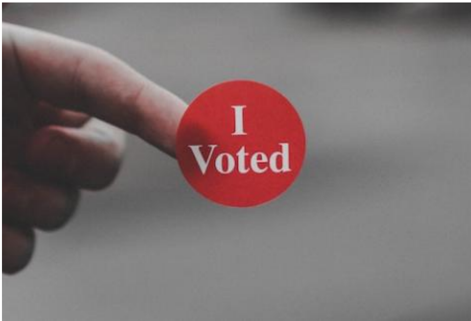
"I voted" sticker

Four years later, our political climate is both frostier and on fire. Yet I am even more convinced that the biggest need is for us to answer this question about hope, across political, and even church, divides.