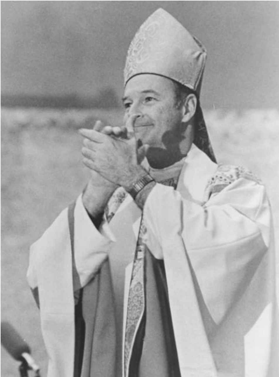
Then-New York Auxiliary Bishop Theodore McCarrick in 1978

McCarrick serves as the president of the Catholic University of Puerto Rico. He is made a monsignor by Pope Paul VI in 1965.