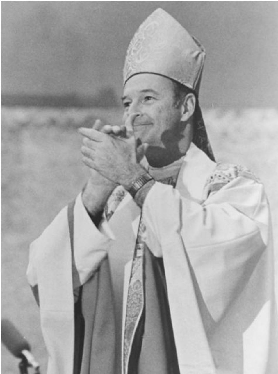
Then-New York Auxiliary Bishop Theodore McCarrick in 1978

McCarrick serves as the president of the Catholic University of Puerto Rico. He is made a monsignor by Pope Paul VI in 1965.