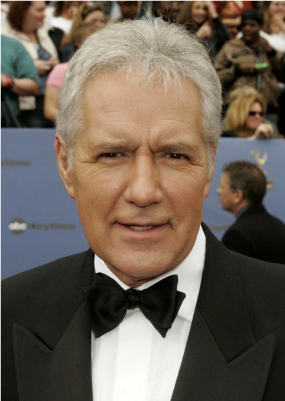
Alex Trebek, host of the game show "Jeopardy," is seen in this 2006 file photo. He died Nov. 8, 2020, from complications related to pancreatic cancer. He was 80.