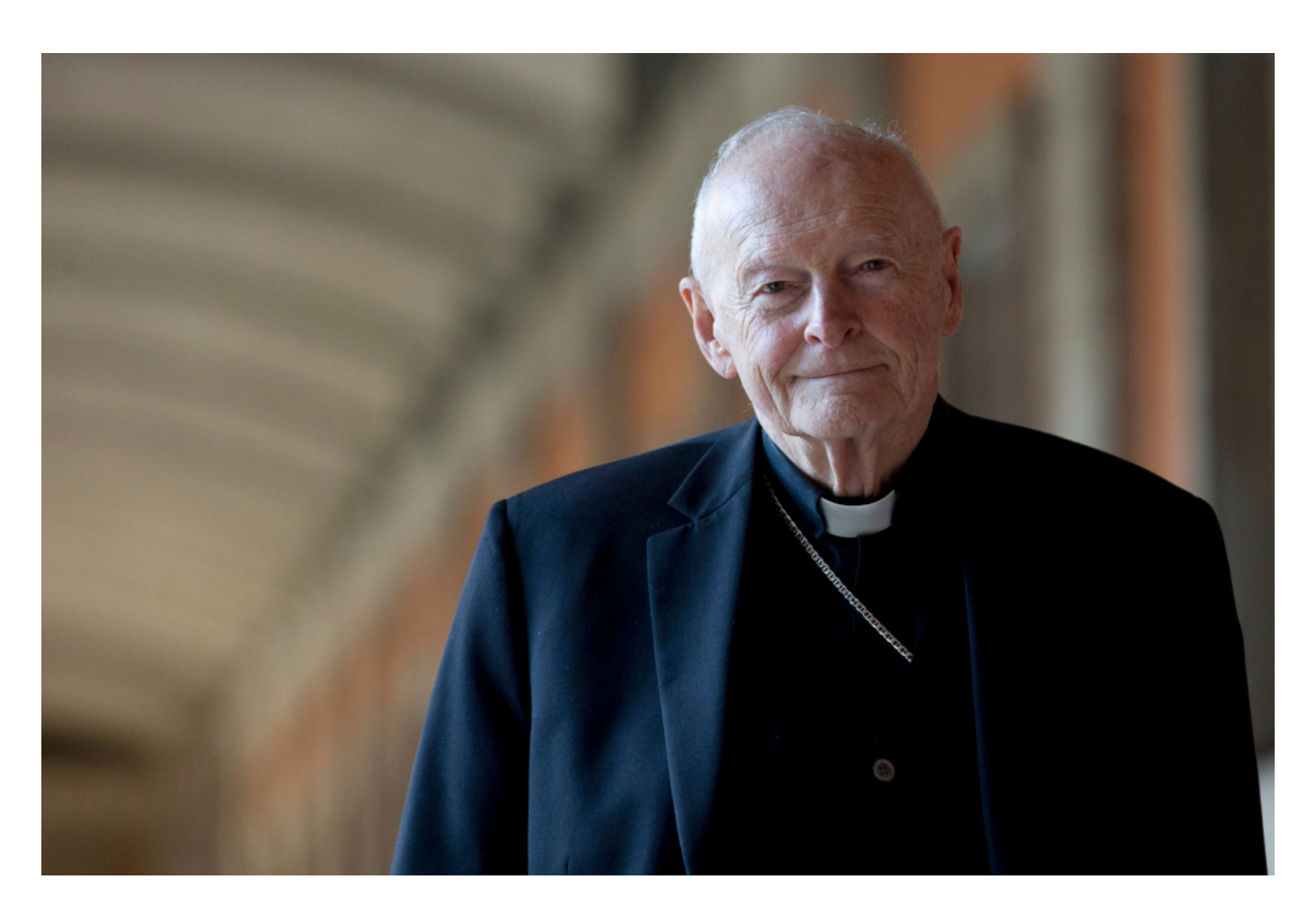
In this Feb. 13, 2013 file photo, Cardinal Theodore Edgar McCarrick poses for a photo in Rome.