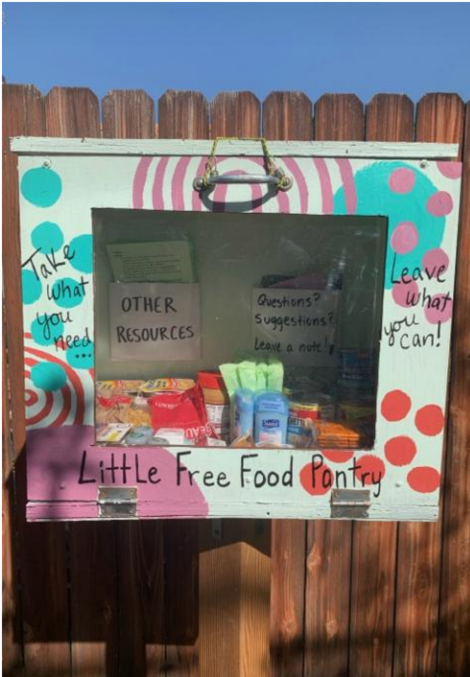
The Little Free Pantry in front of the Denver Loretto Volunteer House

When I made my way to a back-and-away corner of the yard, I found the dilapidated skeleton of what used to be a Little Free Library . Unfinished, filled with leaves and with a dysfunctional latch, my next project rested atop its rickety post and tiredly leaned against the fence.