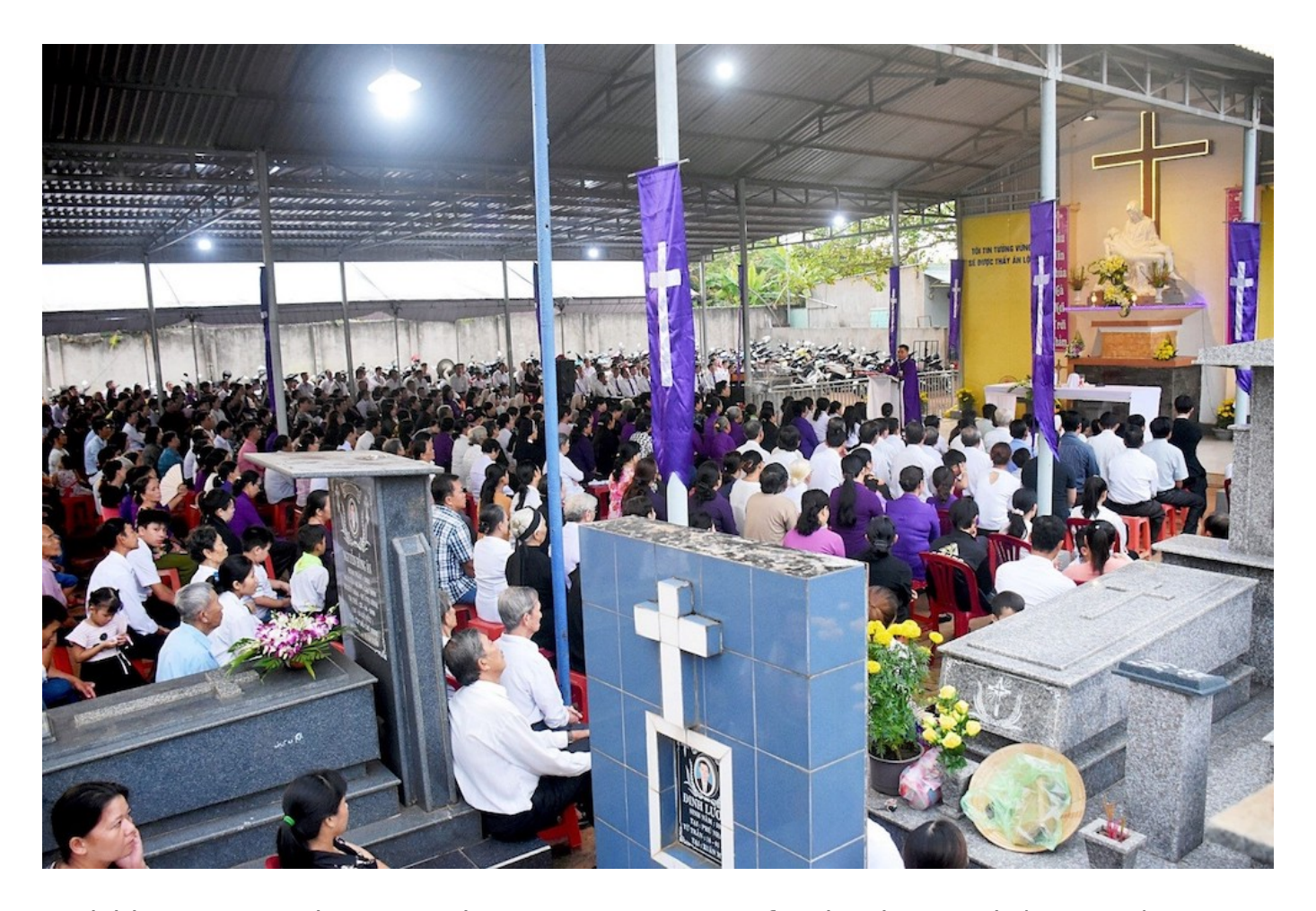
Parishioners attend Mass at the cemetery to pray for the departed.

In the church in Vietnam, November is not only designated as a special month for prayers for the souls of the deceased, but is also a time to commemorate the merits of the deceased. Before beginning this month, most Vietnamese families prepared the graves of their deceased loved ones by going to the cemetery to clean, decorate and put flowers on the graves.