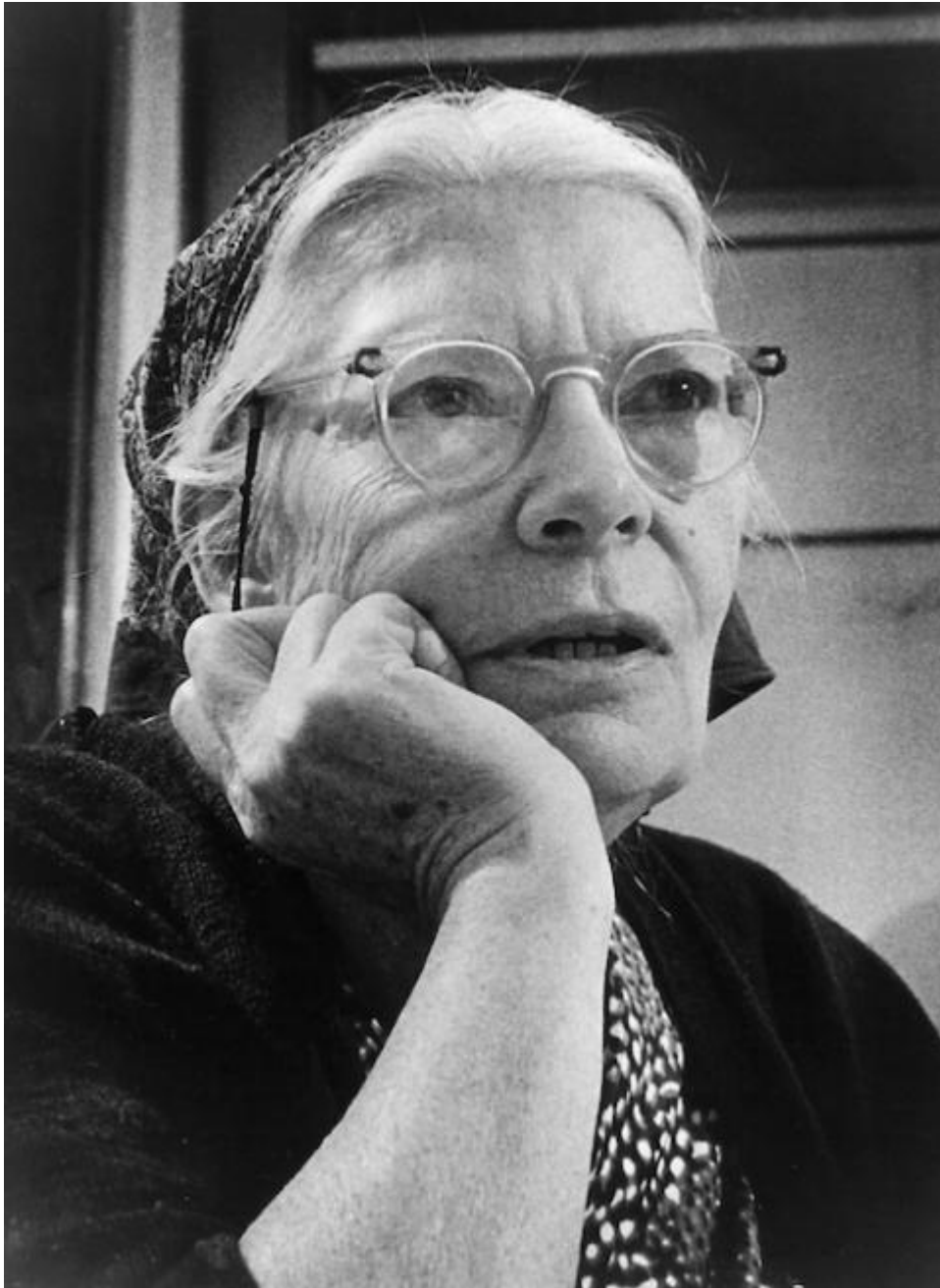
Dorothy Day, co-founder of the Catholic Worker movement, pictured in an undated photo

Soon the God-haunted Dorothy was herself baptized, having solicited the help of a local nun and four priests she had met in New York and on Staten Island. The priests treated her compassionately, encouraging her to continue to work as a freelance journalist to support her family. For the good of her daughter, they advised her not to forsake her common-law marriage. Who knows what would have become of convert Dorothy had she met a stricter band of clerics