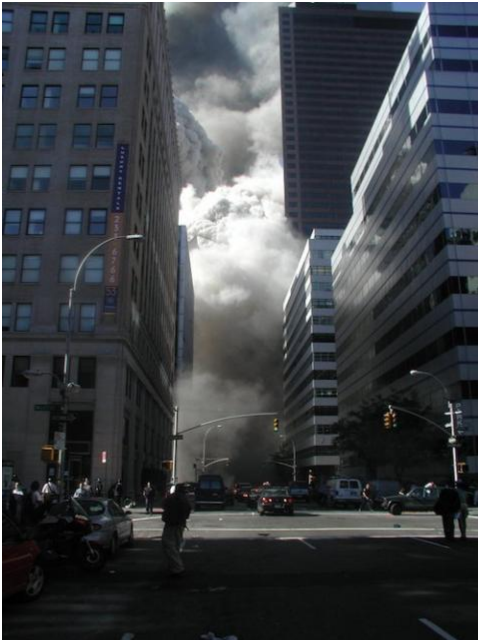
A cloud of dust and smoke is seen through the buildings along West Broadway in New York City, after the collapse of World Trade Center 2 on Sept. 11, 2001.

His poems include scenes of his grandmother going to Mass or reading an Arabic newspaper. He believes she and his parents send him messages via his dreams telling him to be careful. At the book's center is the poet's father, proprietor of Joseph's Market in Detroit, whose food store was looted and trashed. A few years later, he was shot in a robbery, which he survived.