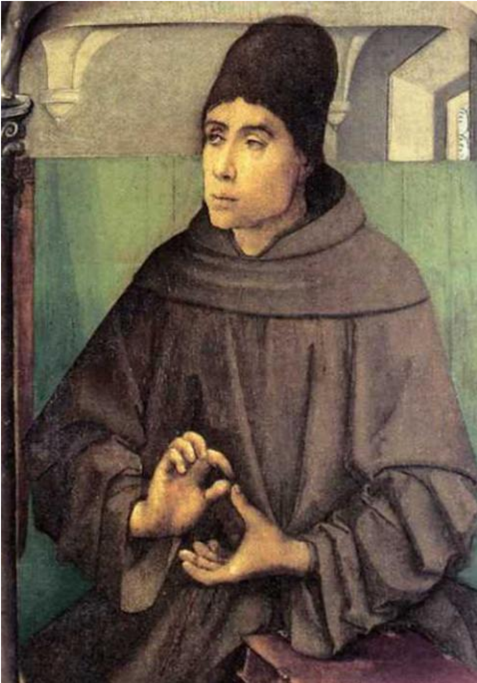
Painting "Scoto (Duns Scotus) - Studiolo di Federico da Montefeltro" by Giusto di Gand, Berruguete Pedro, circa 1472-76

What the church will not reconsider is the place of original sin as the reason for the incarnation, despite the science of evolution. Duns Scotus thought that original sin distorted the meaning of God as love, essentially making the incarnation "plan B" for a fallen creation. He did not deny original sin but at the same, he said, it is not the