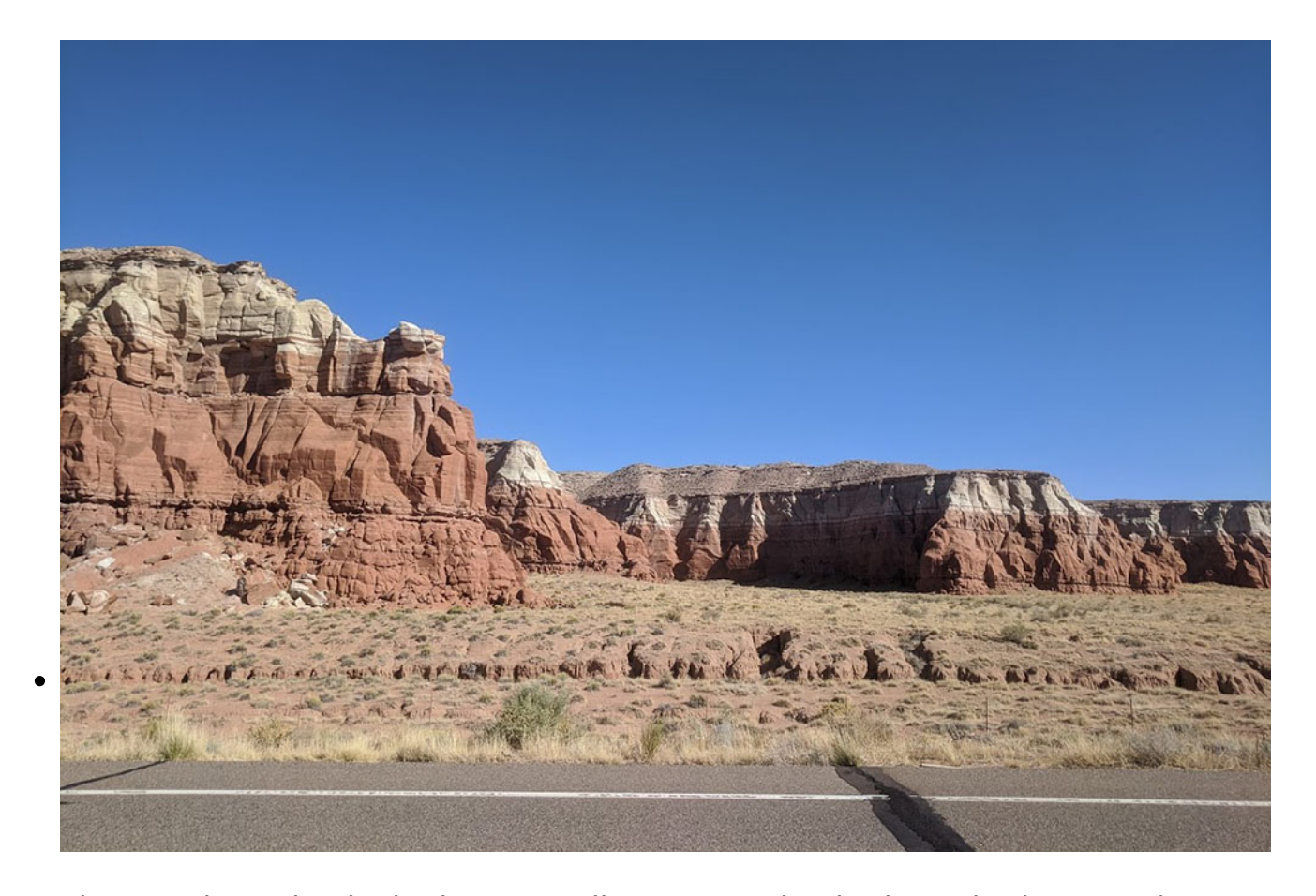
The Navajo Nation is the largest Indian reservation in the United States. (Peter Tran)