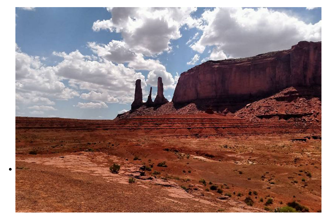
The Navajo Nation is the largest Indian reservation in the United States. (Peter Tran)