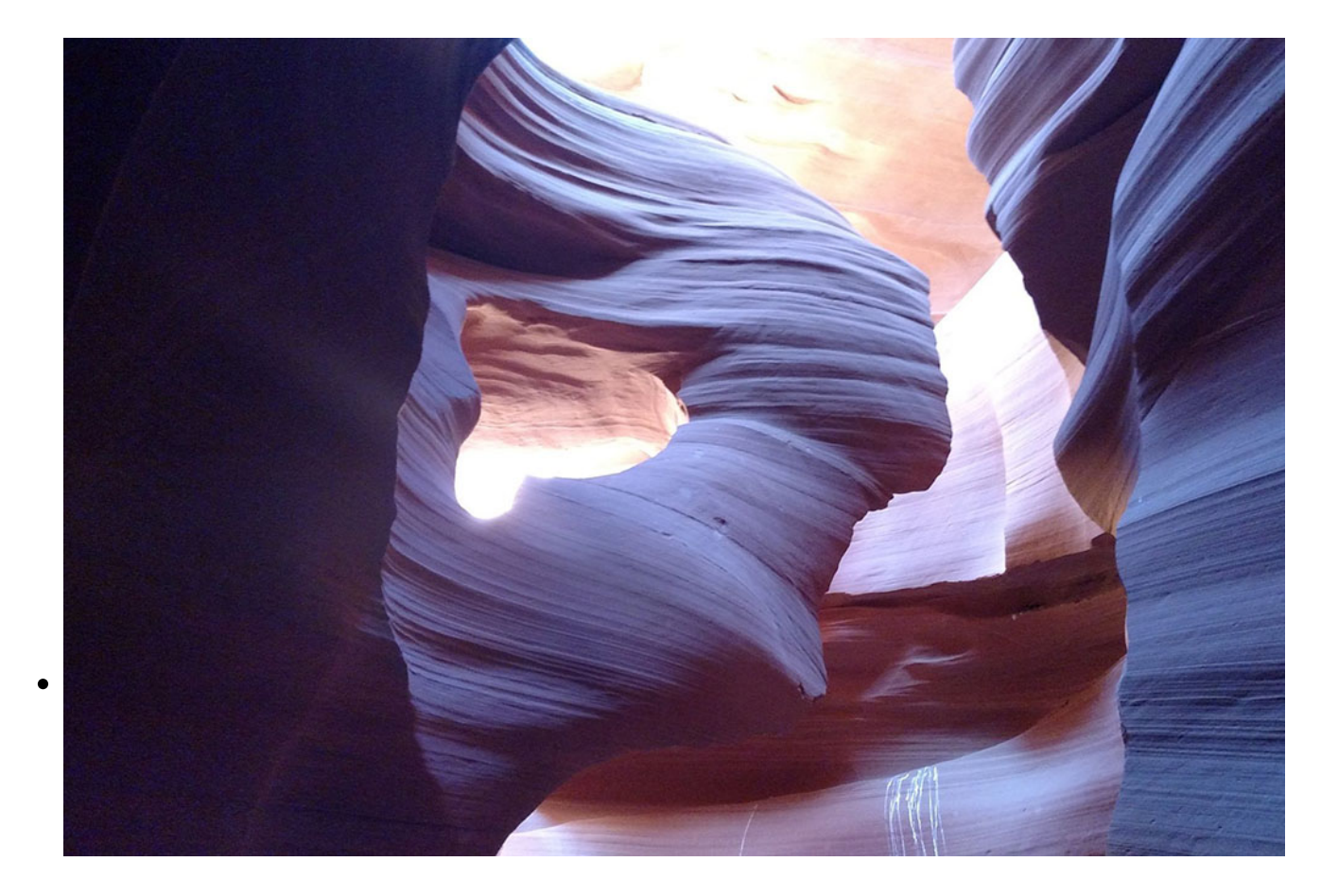
Antelope Canyon is pictured; the Navajo Nation is the largest Indian reservation in the United States. (Peter Tran)