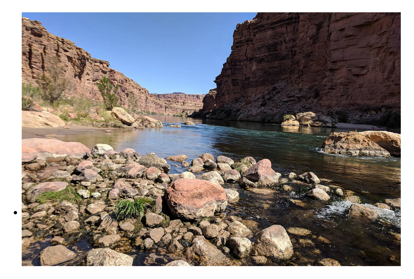
The Colorado River is pictured; the Navajo Nation is the largest Indian reservation in the United States. (Peter Tran)

Curfews and weekend lockdowns have been in place for months to prevent the spreading of the coronavirus, and with cases rising again. A stay-at-home order was issued Nov. 16 and extended through Dec. 27 as Navajo Nation officials requested a disaster declaration from the federal government to get additional infrastructure and financial resources. The first reported coronavirus case in the Navajo Nation was in mid-March, and by May, it had the highest per capita coronavirus infection rate in the country. As of Dec. 3, the Navajo Nation recorded 17,310 cases of COVID-19 and 663 deaths.