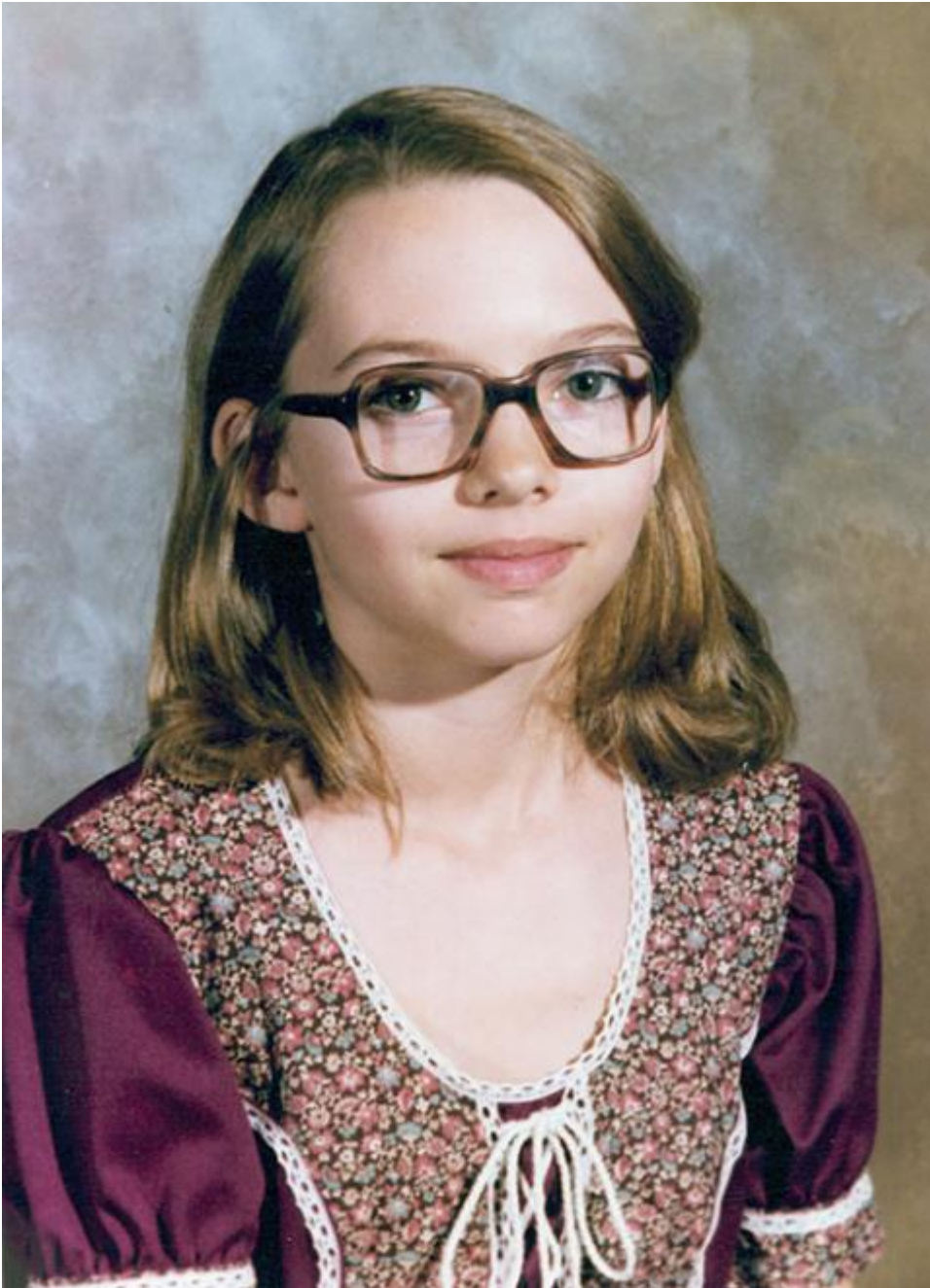
Lisa Montgomery, at the age when her stepfather began raping her

Montgomery was born with brain damage from her mother's drinking; the mother brutally beat all her children and began prostituting Montgomery in her early teens. At times, Montgomery was raped by several men, one after the other, for hours on end. As a consequence of years of sexual torture, she began to disassociate from reality and developed post-traumatic stress disorder. Her school noticed that when she did come to class, she was filthy and dressed in ripped and tattered clothing.