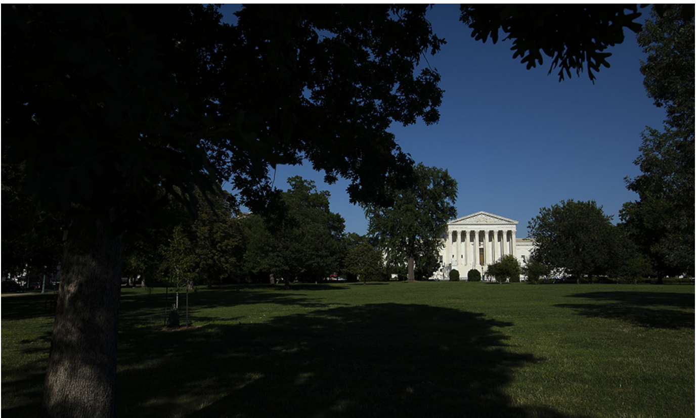
The U.S. Supreme Court in Washington, D.C.