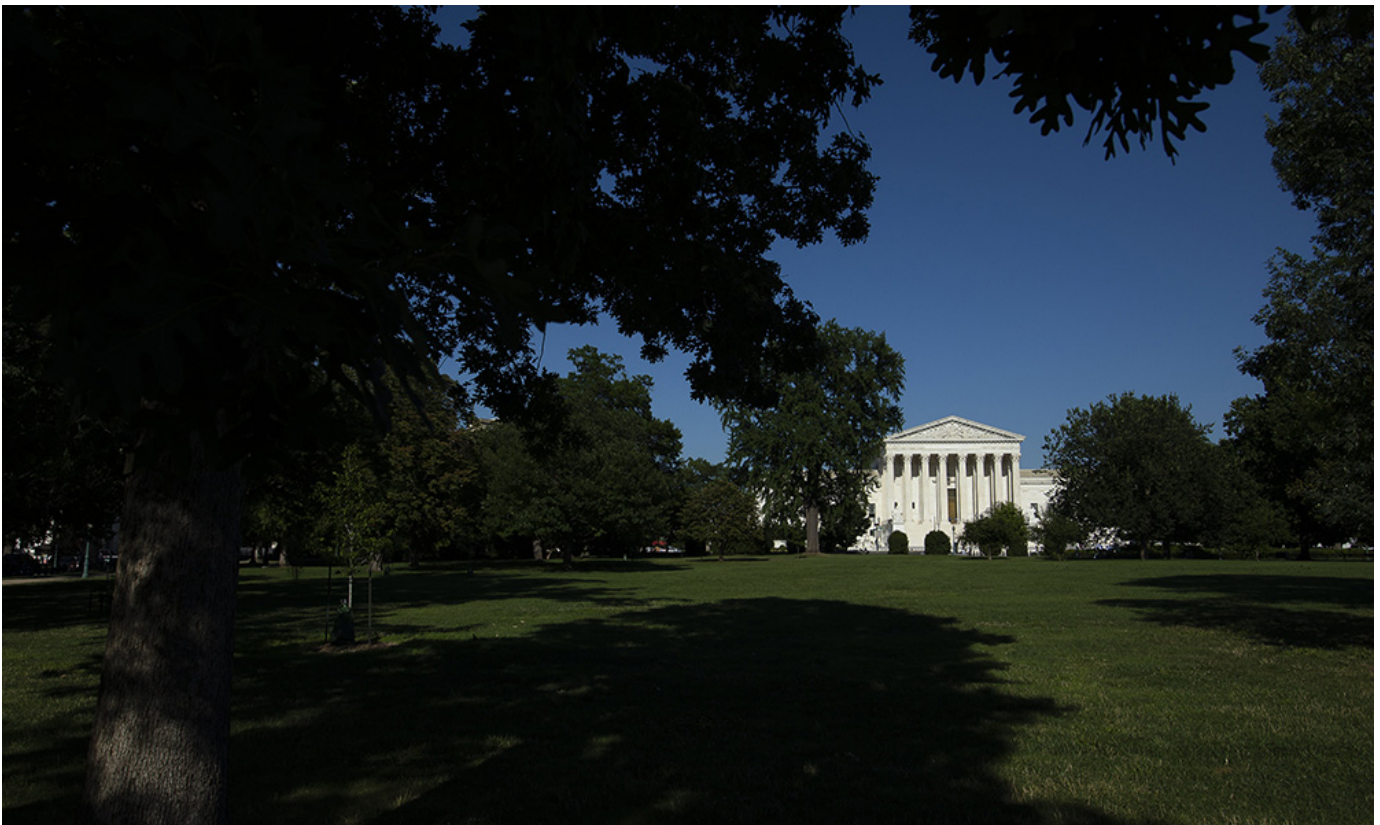
The U.S. Supreme Court in Washington, D.C.