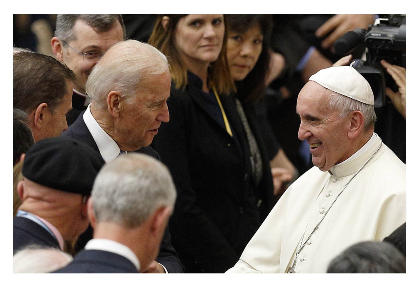
Then-U.S. Vice President Joe Biden meets Pope Francis after both leaders spoke at a conference on adult stem cell research at the Vatican in April 2016.

First, as the world struggles to overcome COVID-19, the Biden-Harris team will <u>reset</u> the U.S. relationship with the World Health Organization (WHO). Second, in an effort to tackle the ecological crisis, Biden will rejoin the <u>Paris Climate Accord</u>.