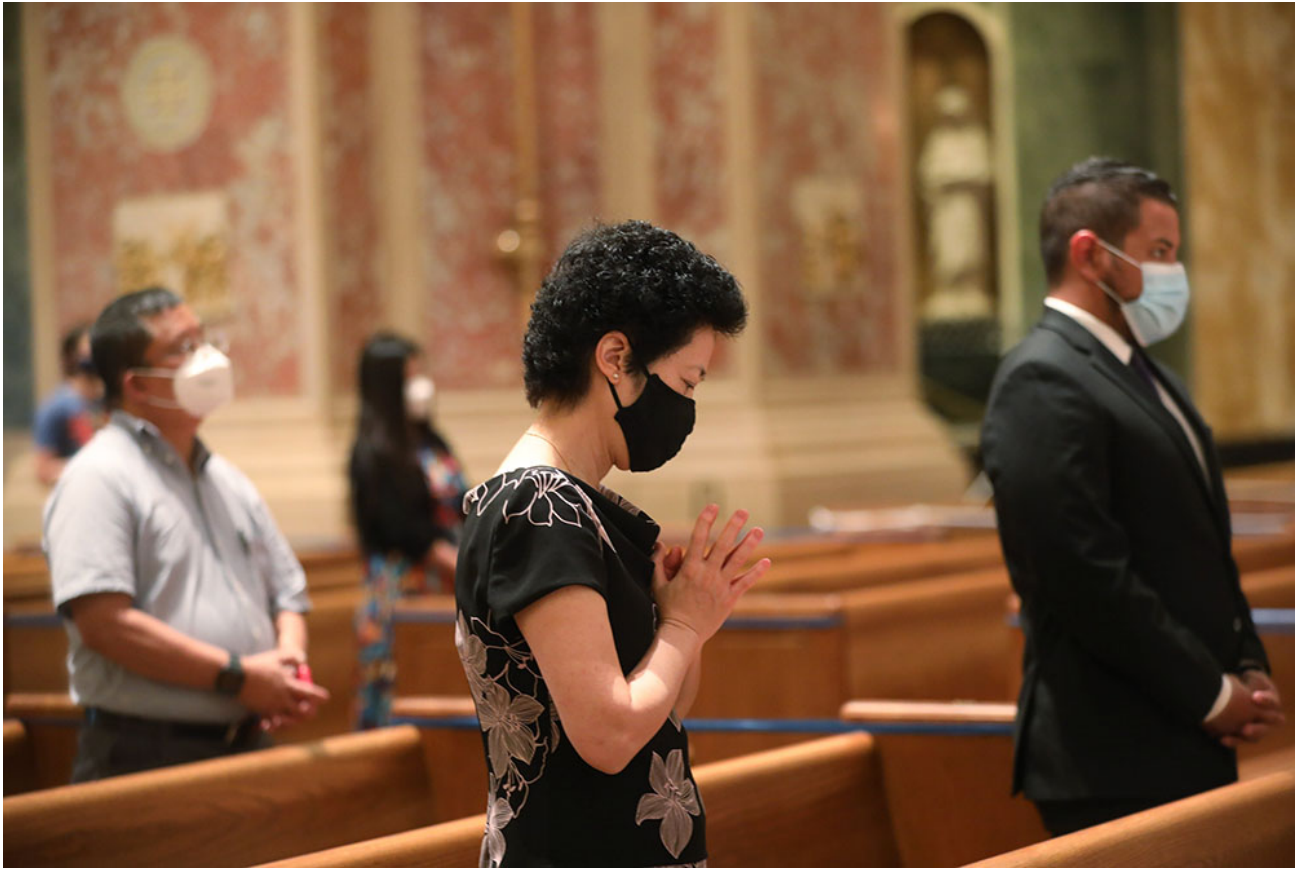
People pray during a 2020 Mass at the Cathedral of St. Matthew the Apostle in Washington.