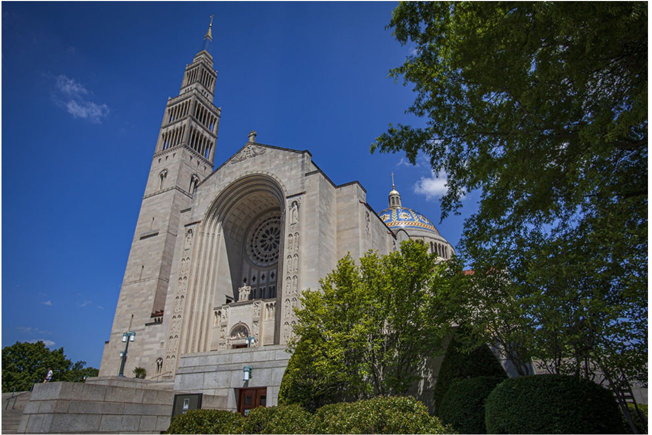
The Basilica of the National Shrine of the Immaculate Conception in Washington is seen in mid-May 2020.