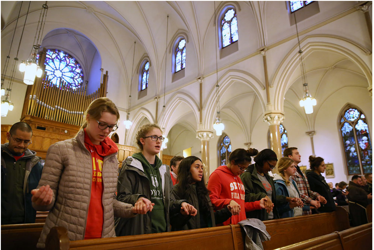
Students from Elizabeth Seton High School in Bladensburg, Maryland, pray during a March 24, 2018 Mass at St. Patrick Catholic Church in Washington.