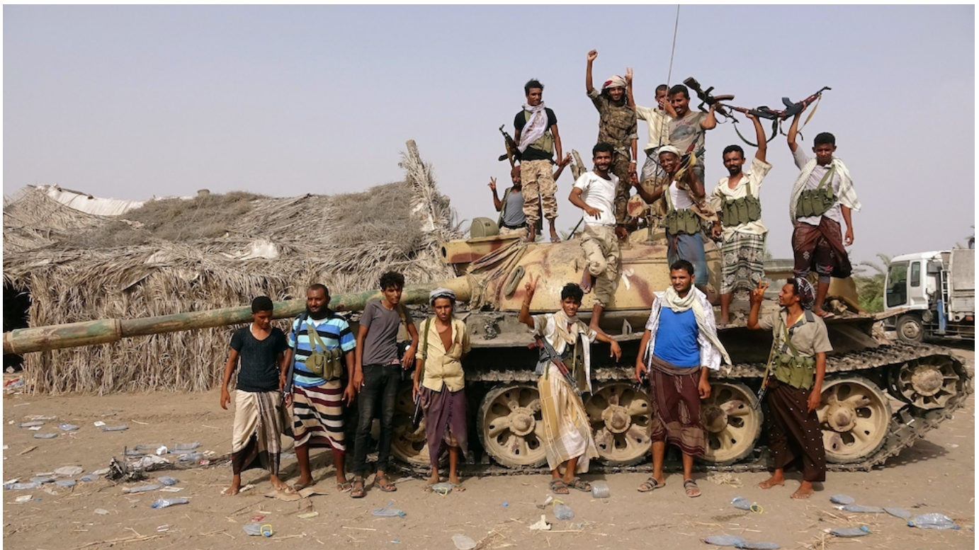
Tribal fighters loyal to the Yemeni government pose for a photo by a tank near Hodeida, Yemen, June 1, 2018. There are flattened plastic water containers strewn the ground.

So we supported a water infrastructure program, which is not our usual kind of work. We usually work much more on dialogue and reconciliation. And what that did is the religious actors went to the young people who were being recruited by al Qaeda and ISIS affiliates, and with a spiritual narrative and a community narrative they brought them into these programs so that they would commit their energies to actually helping develop necessary infrastructures, so the communities could be improved and have their basic needs met — in this case, water.