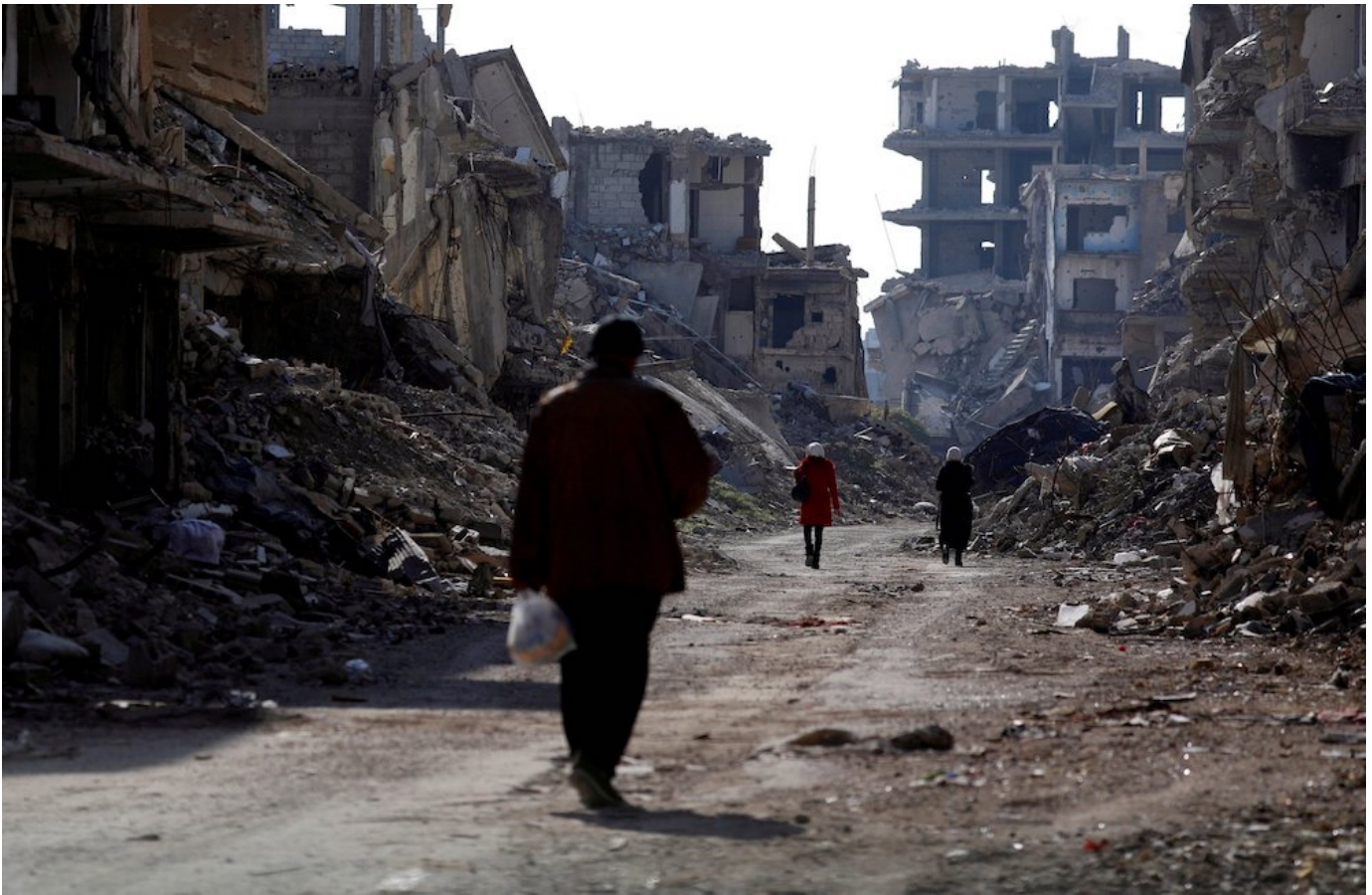
People walk past damaged buildings at the Yarmouk Palestinian refugee camp on the outskirts of Damascus, Syria Dec. 2.

Gore: Probably one of the main things to lift up is the migration that results when people can no longer feed their families and are so desperate that they need to leave. And that did of course happen in the 2010 drought in Syria, and it has happened also [in] Central America, in what's known as the Dry Corridor, where a lot of migration is coming from.