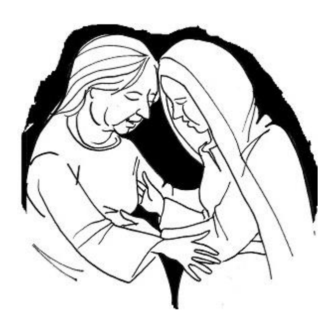
"My soul magnifies the Lord" (Luke 1:46).