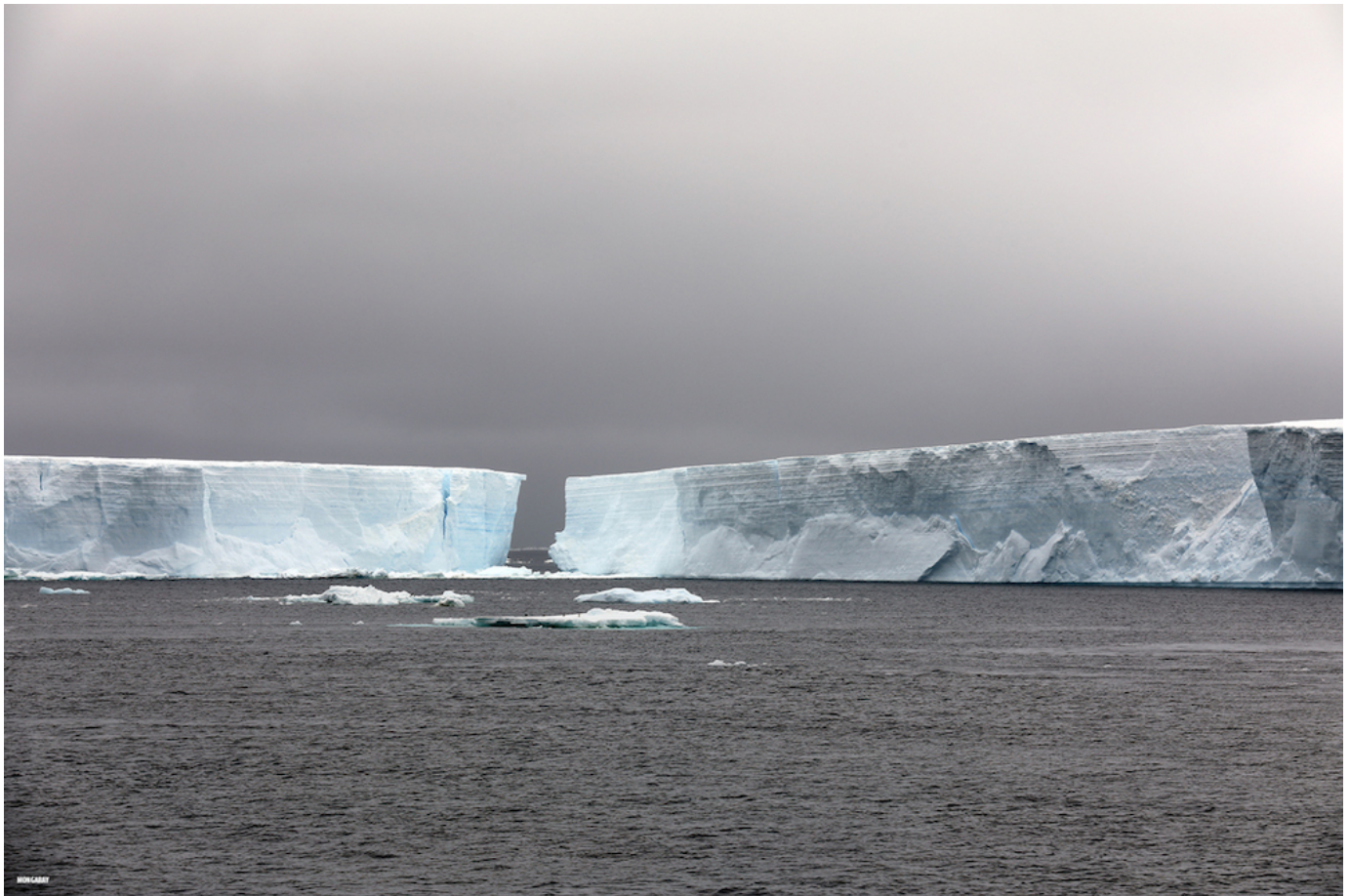
Glaciers and icebergs in Antarctica

Whether you agree or not with the original Gaia theory, it is obvious that we are becoming collectively self-aware of the bad consequences of our actions on our own life-support system. My proposal with Bruno Latour is that we could in principle add a bit of self-awareness to the Earth's self-regulation. At the very least we could sense where things are going wrong better (through satellites etc) and correct our mistakes faster. We could also use the prior Gaia to provide a template for designing a more flourishing sustainable future — including sustainable energy, material recycling, and horizontal information exchange, supporting a rapid learning process.