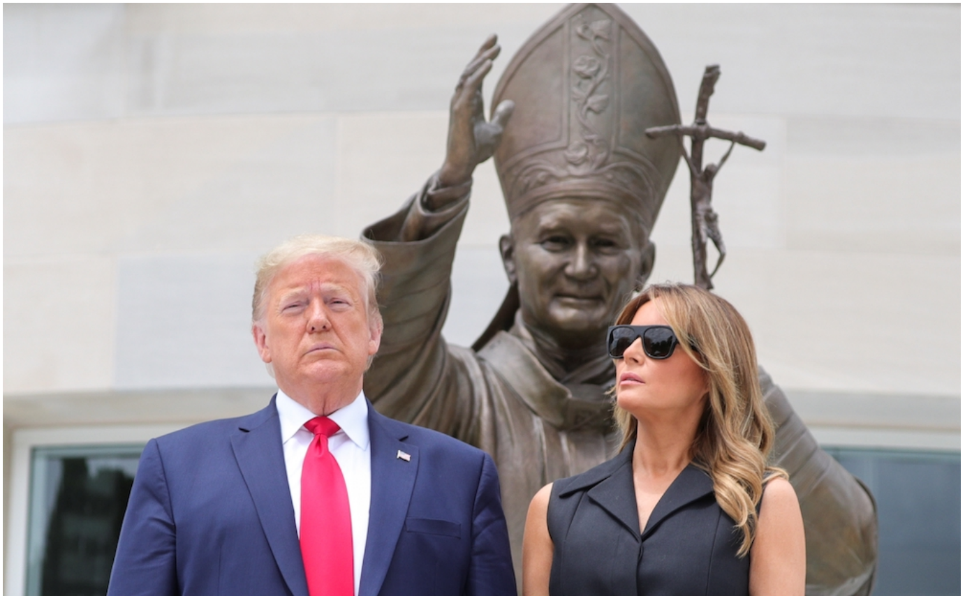
U.S. President Donald Trump and first lady Melania Trump pose outside the St. John Paul II National Shrine in Washington June 2, 2020, the 41st anniversary of beginning of pope's 1979 historic visit to Poland.

The clues were emblazoned on the red hats and in the chants at every rally: Make America Great Again! Fake news! Lock her up! You're fired! Drain the swamp! Build a wall! These slogans had the power to whip the crowd into a frenzy, giving Trump a fresh source of energy — or as psychologists would say, "narcissistic supplies."