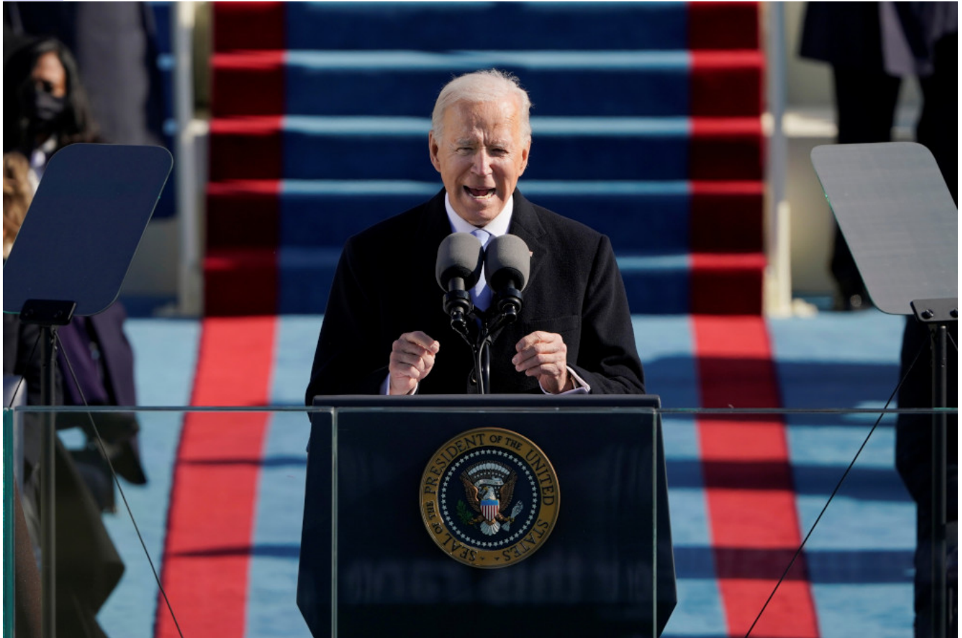
U.S. President Joe Biden speaks during his inauguration at the Capitol in Washington Jan. 20, 2021.