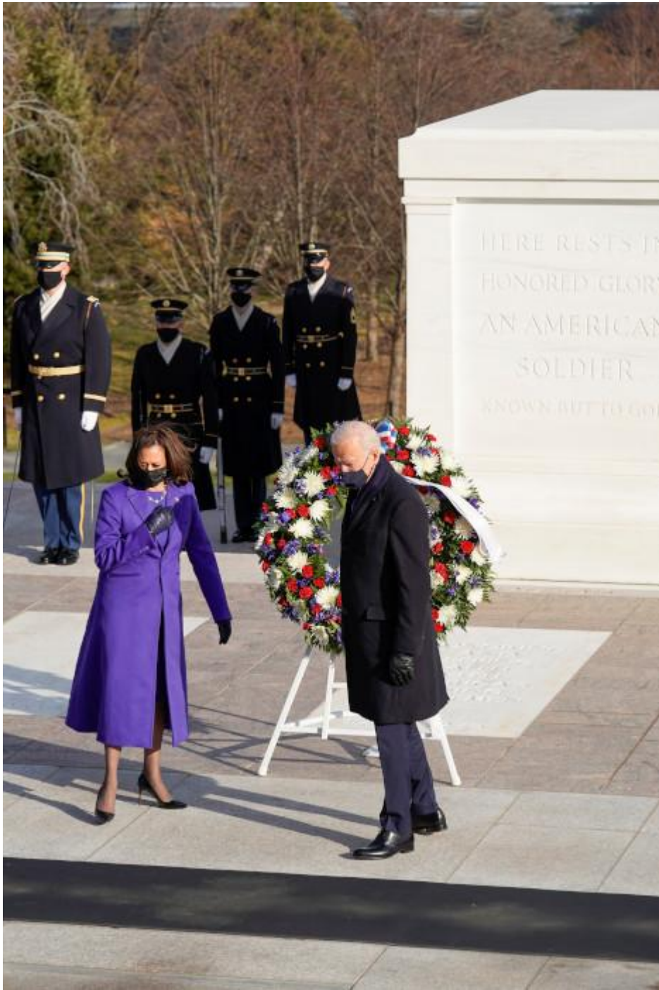
President Joe Biden and Vice President Kamala Harris participate in a wreath-laying ceremony at the Tomb of the Unknown Soldier at Arlington National Cemetery in Arlington, Va., Jan. 20, 2021.

raging fire destroying everything in its path. Every disagreement doesn't have to be a cause for total war, and we must reject the culture in which facts themselves are manipulated and even manufactured.