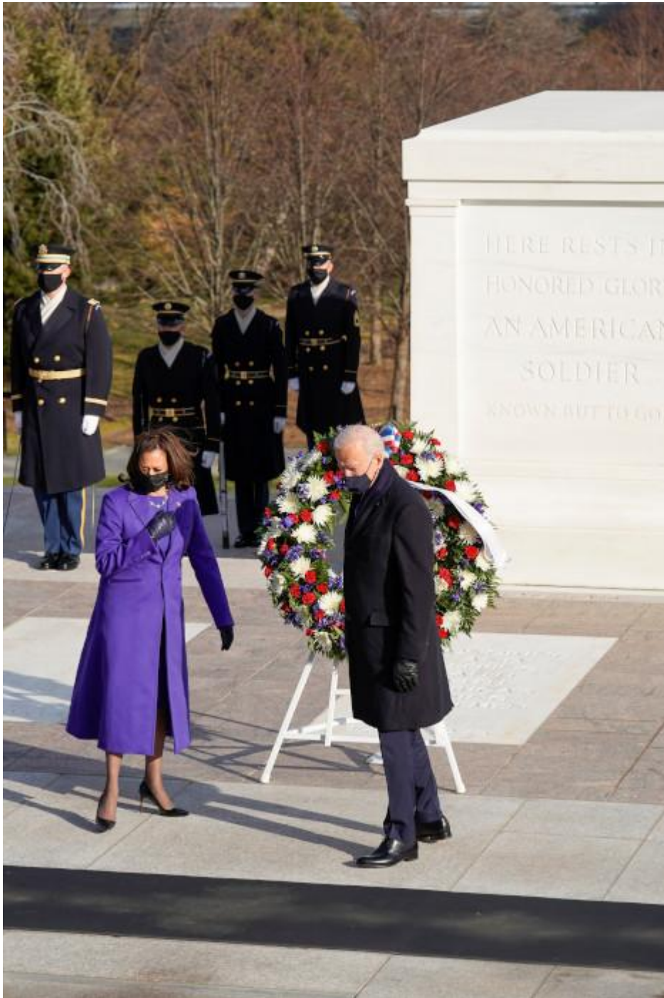
President Joe Biden and Vice President Kamala Harris participate in a wreath-laying ceremony at the Tomb of the Unknown Soldier at Arlington National Cemetery in Arlington, Va., Jan. 20, 2021.

raging fire destroying everything in its path. Every disagreement doesn't have to be a cause for total war, and we must reject the culture in which facts themselves are manipulated and even manufactured.