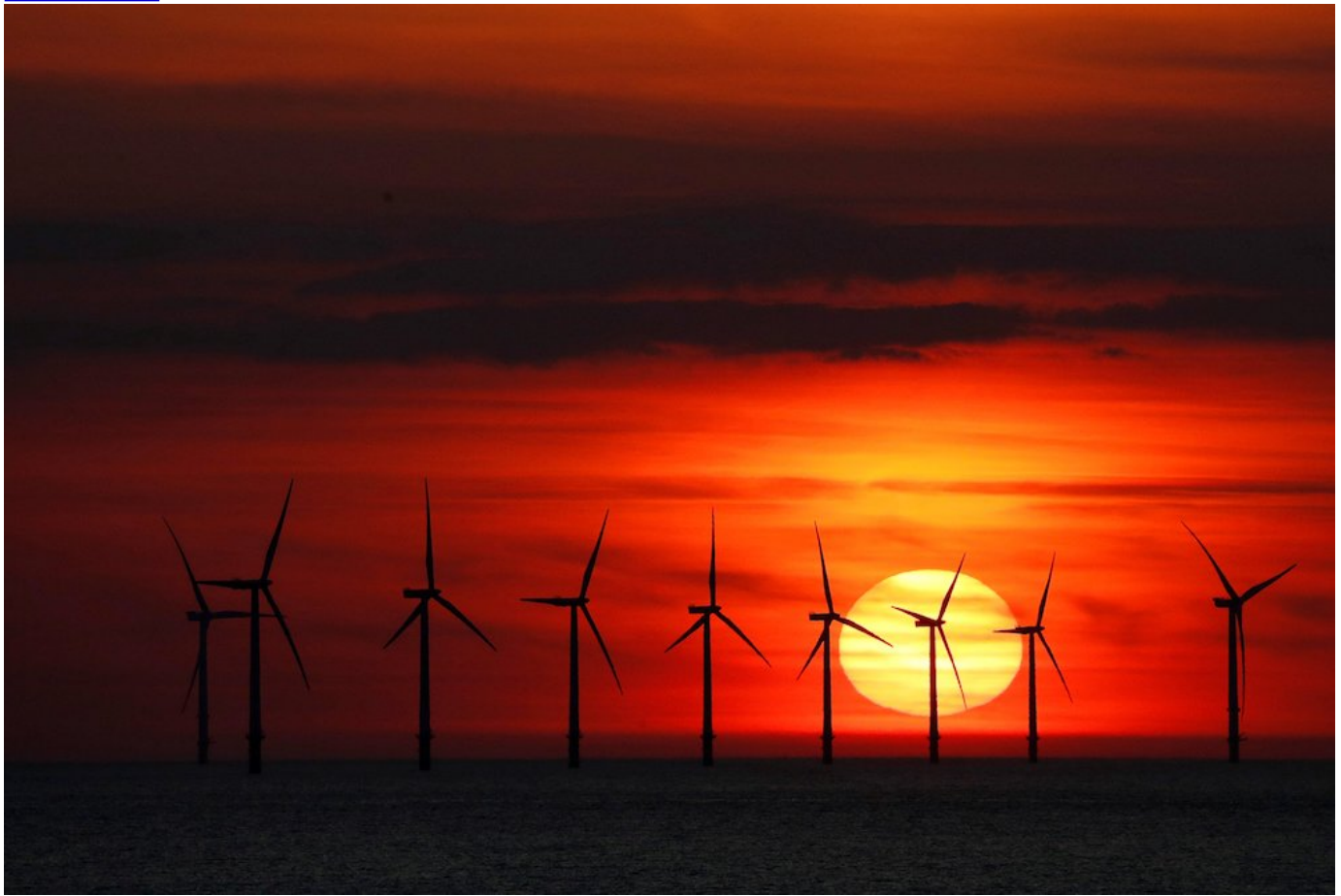
A wind turbine farm near New Brighton, England