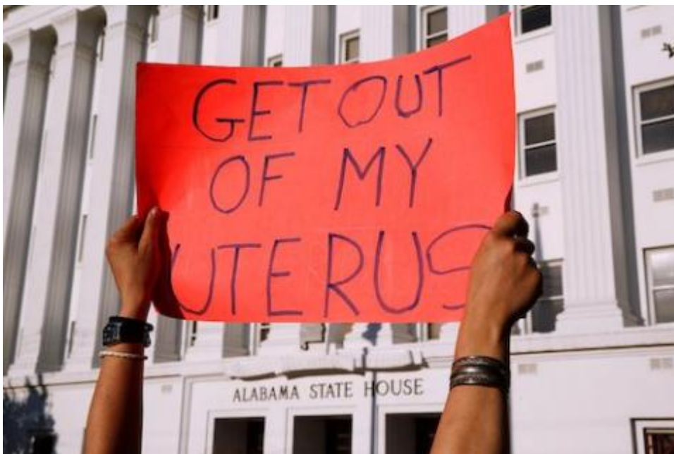
A demonstrator in front of the Alabama State House protests May 14, 2019, against an Alabama law banning nearly all abortions.

Catholics who uphold magisterial teachings on morality ought to find common cause with pro-choice advocates because of our many shared goals of eliminating poverty, fighting structural racism, working for peace and protecting the environment. Moreover, the policies promoted by the Democratic Party are demonstrated to work to reduce abortion as 48 years of culture war and misguided legislation from the right have not. And it is a mistake for pro-life Catholics to treat pro-choice concerns about personal privacy and bodily autonomy as irrelevant. Yes, we want a culture in which women choose life. Do we want one in which they are coerced into doing so? What kind of moral landscape would that be?