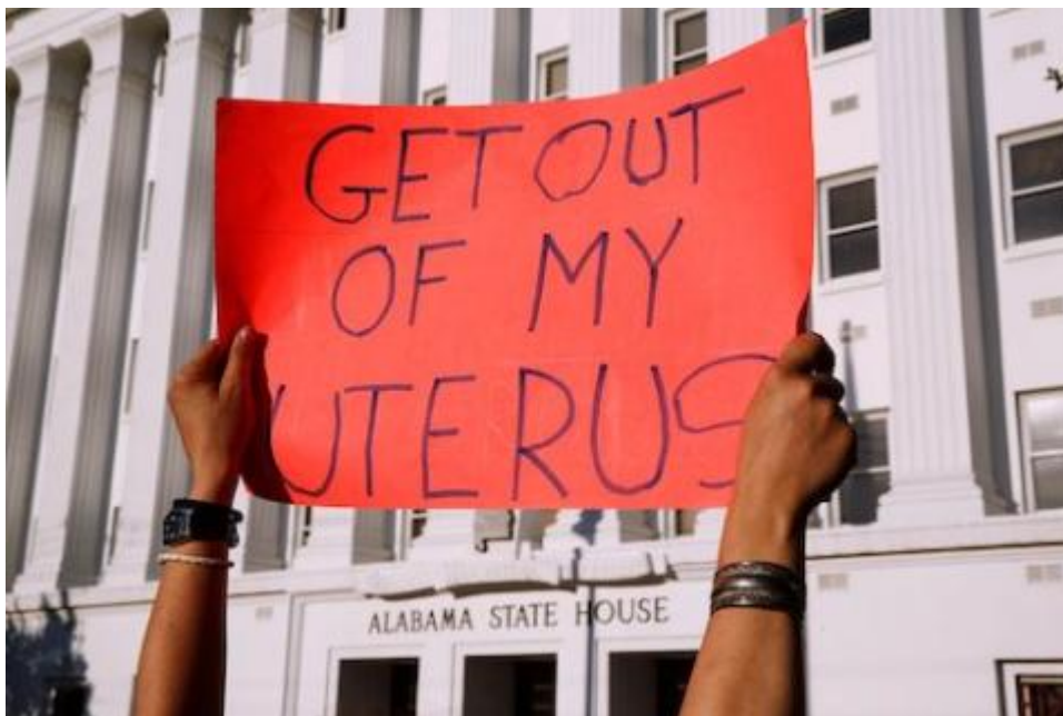
A demonstrator in front of the Alabama State House protests May 14, 2019, against an Alabama law banning nearly all abortions.

Catholics who uphold magisterial teachings on morality ought to find common cause with pro-choice advocates because of our many shared goals of eliminating poverty, fighting structural racism, working for peace and protecting the environment. Moreover, the policies promoted by the Democratic Party are demonstrated to work to reduce abortion — as 48 years of culture war and misguided legislation from the right have not. And it is a mistake for pro-life Catholics to treat pro-choice concerns about personal privacy and bodily autonomy as irrelevant. Yes, we want a culture in which women choose life. Do we want one in which they are coerced into doing so? What kind of moral landscape would that be?