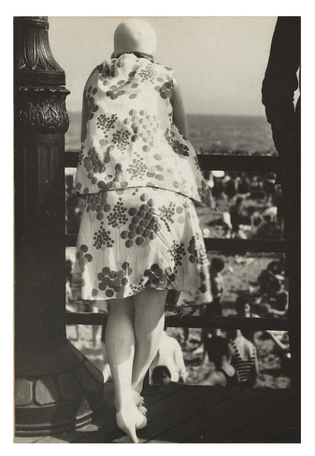
"Coney Island Boardwalk, 1929," gelatin silver print by Walker Evans