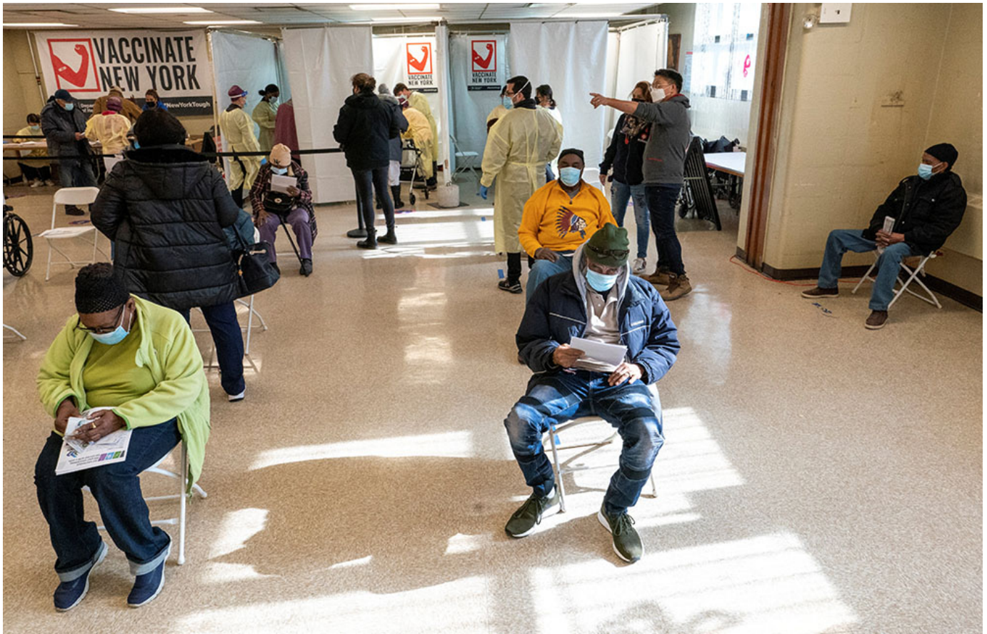
Residents of William Reid Apartments in the Brooklyn borough of New York City rest for a few minutes after receiving the first dose of the COVID-19 vaccine Jan. 23.