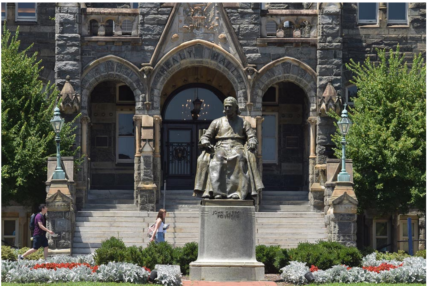
This statue of Georgetown University's founder, Bishop John Carroll, greets students at the Washington campus entrance July 22, 2019.