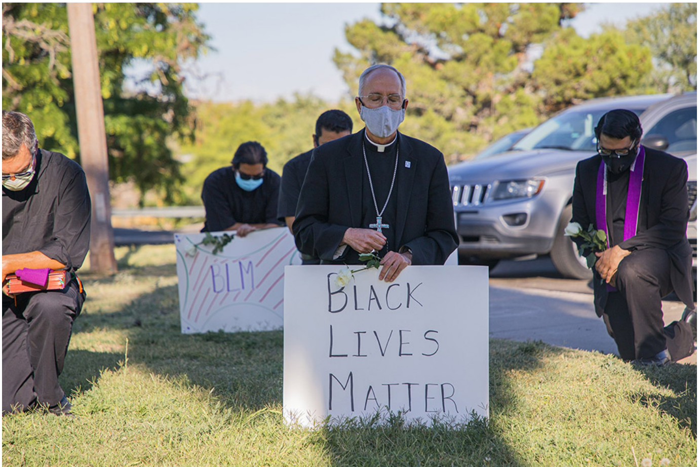
Bishop Mark Seitz of El Paso, Texas, kneels at El Paso's Memorial Park holding a "Black Lives Matter" sign June 1, 2020.

Black Catholics want to feel heard; they want a church that reflects and uplifts them toward liberation; a church that cares about their spiritual and physical lives â?? a church that atones.