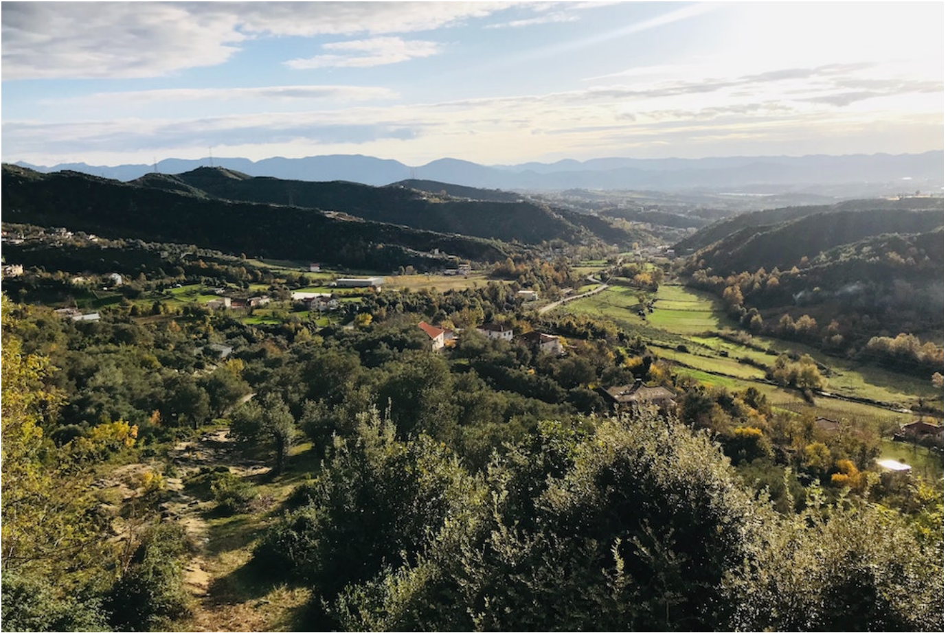
View from Dajt Mountain in Tirana, Albania