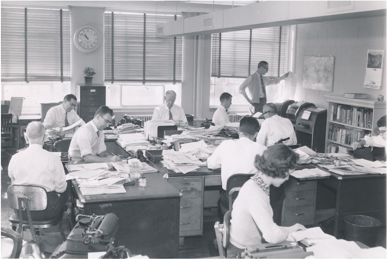
The newsroom of Catholic News Service's predecessor, NC News Service, is pictured in the 1950s.