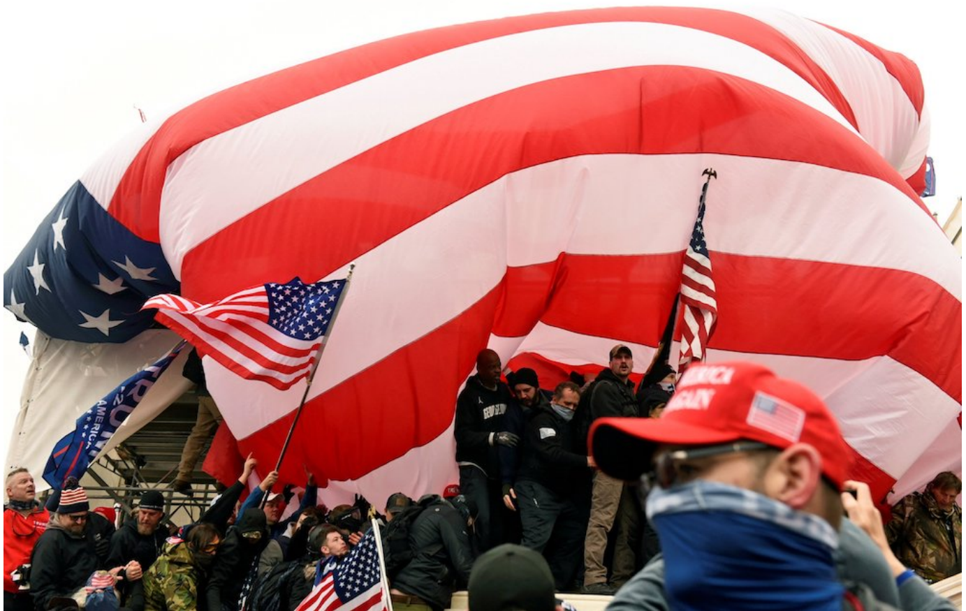
Supporters of President Donald Trump gather in front of the U.S. Capitol in Washington Jan. 6, 2021.