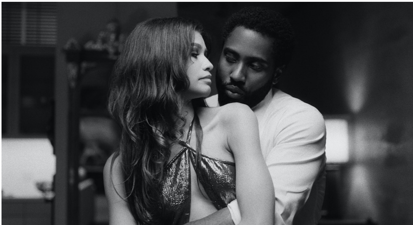
Zendaya as Marie, left, and John David Washington as Malcolm in a scene from "Malcolm & Marie"