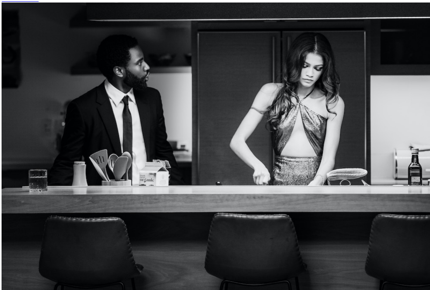
John David Washington as Malcolm, left, and Zendaya as Marie in a scene from "Malcolm & Marie"