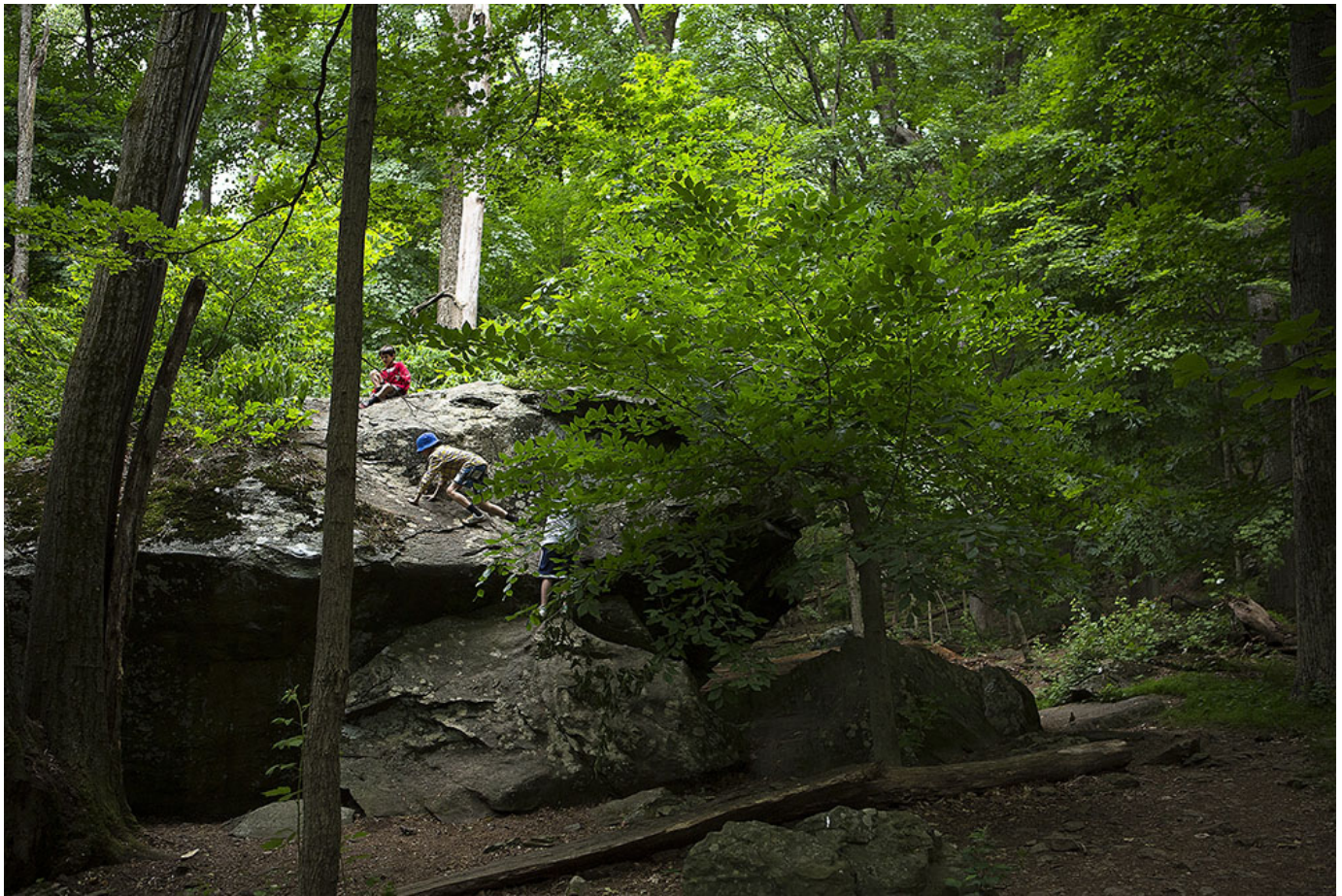
Children explore a trail at Cunningham Falls State Park June 17, 2020, in Thurmont, Maryland.

Estimates of how many species are lost each year vary widely, but scientists say that more species are becoming extinct because of human activities and climate change than would disappear naturally in the same amount of time.