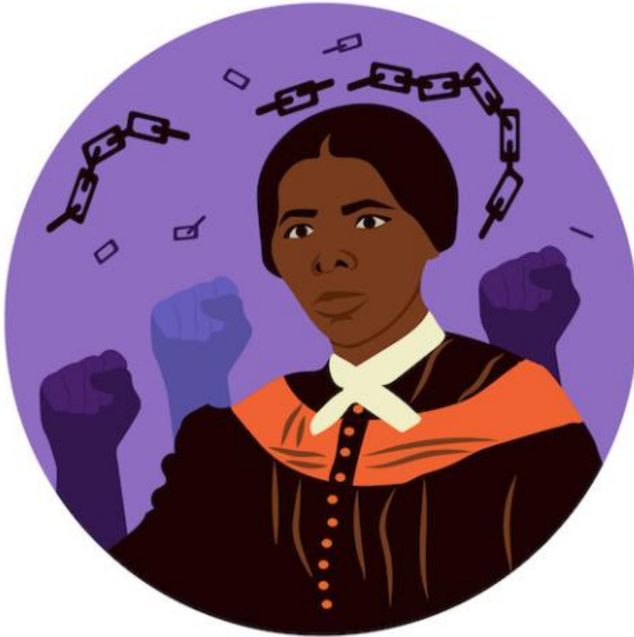
Harriet Tubman, abolitionist