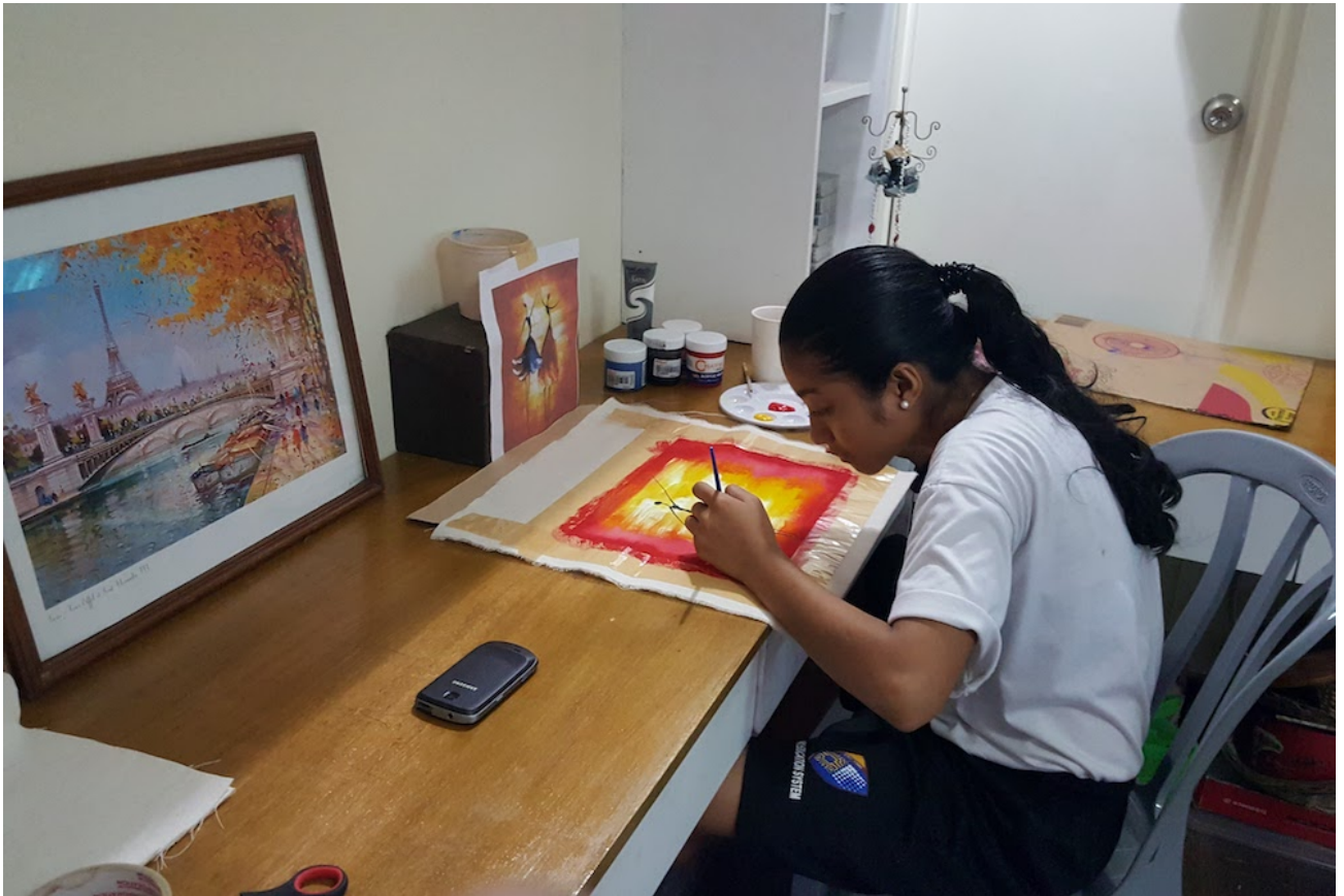
Girls in the School of Life make crafts to earn money for their savings and to sell to help support the school.