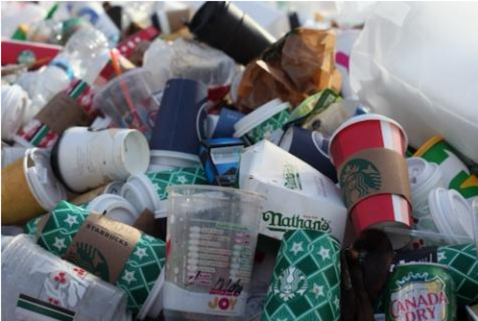
Pile of discarded single use containers, mostly coffee cups

"It's not enough to just talk about the principles. There have to be strategies and campaigns and movements to enact and operationalize those," he said.