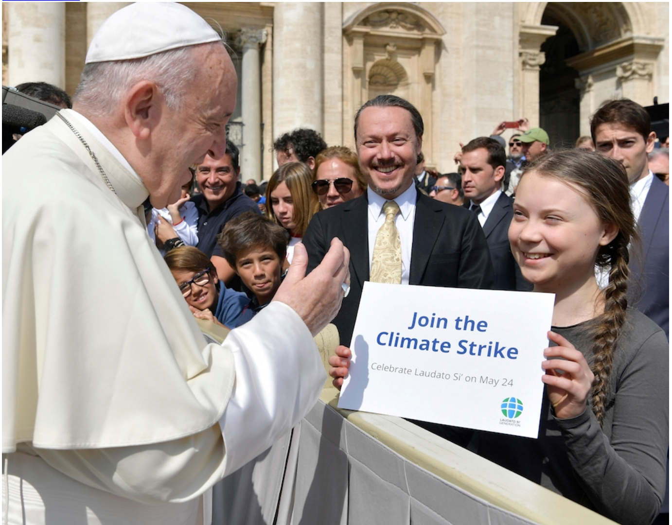
Pope Francis greets Swedish climate activist Greta Thunberg during his general audience in St. Peter's Square at the Vatican April 17, 2019.