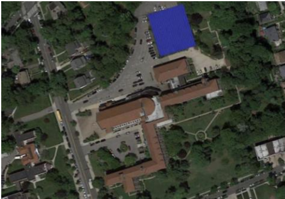
Aerial view of the Passionist monastery and retreat center showing where solar panels are to be installed