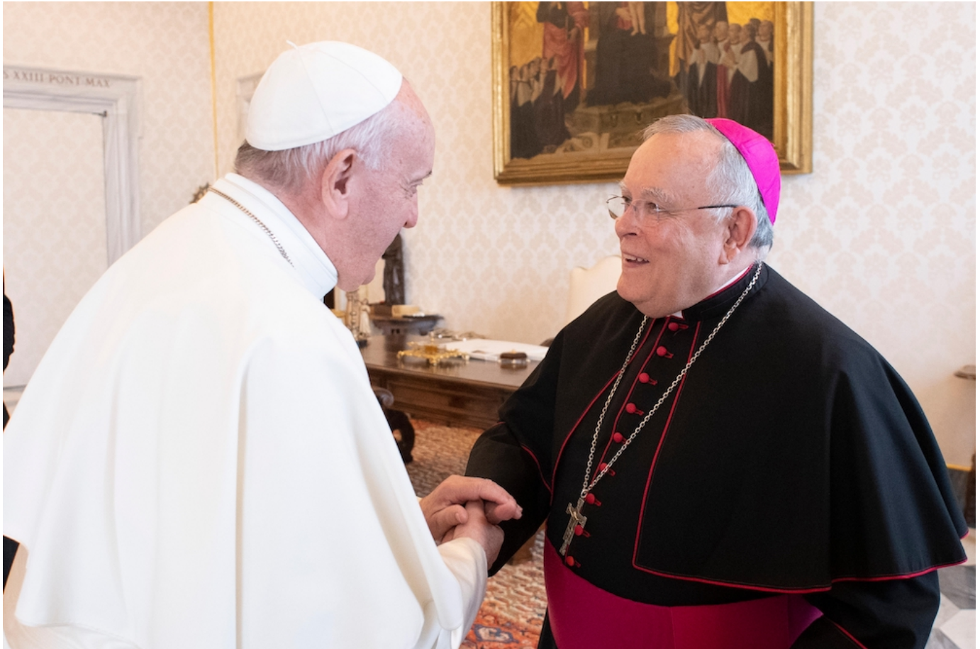
Pope Francis greets Archbishop Charles Chaput of Philadelphia during a meeting with U.S. bishops from New Jersey and Pennsylvania in the Apostolic Palace at the Vatican Nov. 28, 2019.