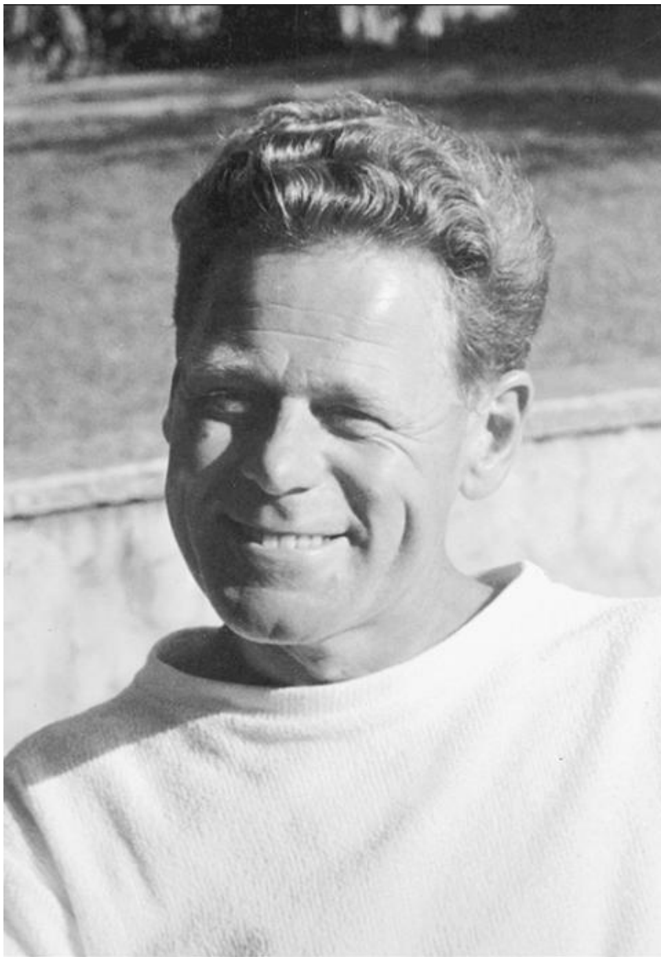
A younger Fr. Hans Küng is seen in an undated photo.

Not only did progressive bishops seek out Küng's acumen and writing skills, but his fluency in French, Italian, Dutch, German, English and Latin made him the go-to guy in dealing with the press. He was quick to publish his views on council texts and backroom maneuvering in leading papers and was a frequent television guest, remembered as much for his good looks and business suits as for his expertise.