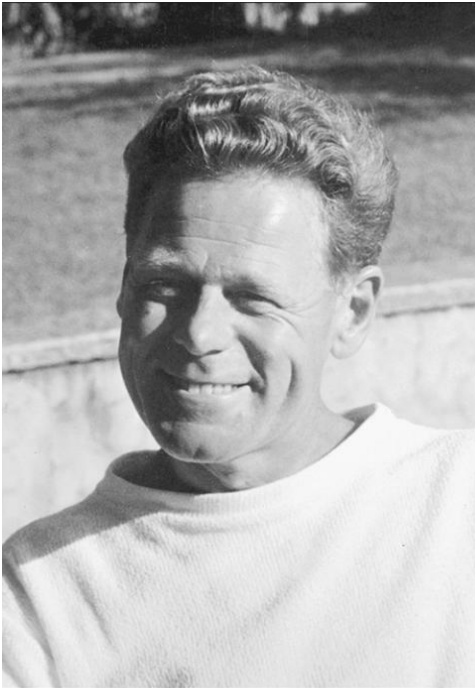
A younger Fr. Hans Küng is seen in an undated photo.

Not only did progressive bishops seek out Küng's acumen and writing skills, but his fluency in French, Italian, Dutch, German, English and Latin made him the go-to guy in dealing with the press. He was quick to publish his views on council texts and backroom maneuvering in leading papers and was a frequent television guest, remembered as much for his good looks and business suits as for his expertise.