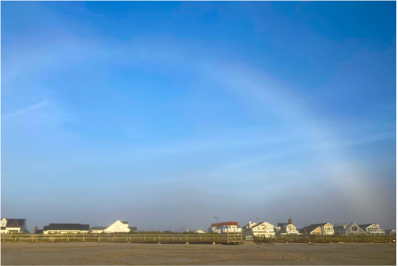
A fogbow over Spring Lake, New Jersey, November 2020