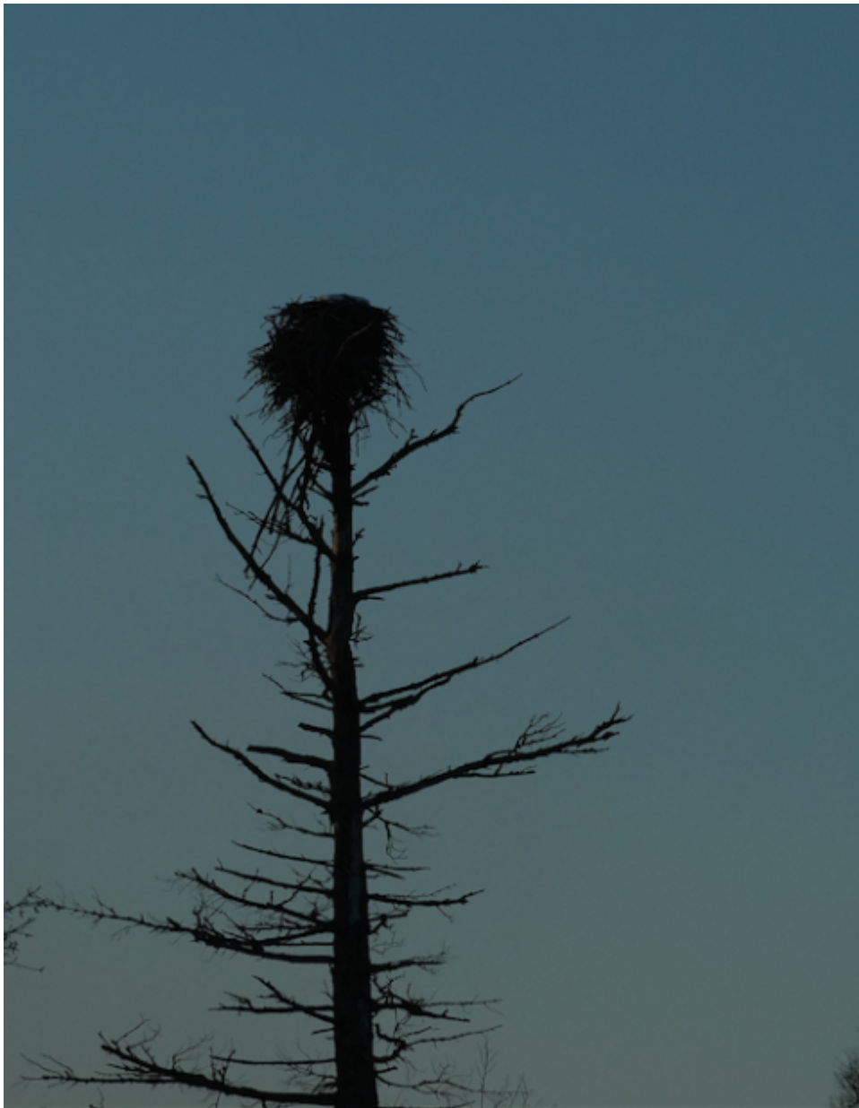
An eagle nest near the Enbridge Line 3 construction site in northern Minnesota

More than a foodstuff, the wild rice, or manoomin , symbolizes the essential cultural connection between land, subsistence gathering and the Ojibwe world view. The act of "making rice" is a tangible expression of the Ojibwe relationship with the earth, one of sustainability and commitment to ensuring resources are protected and available for future generations.