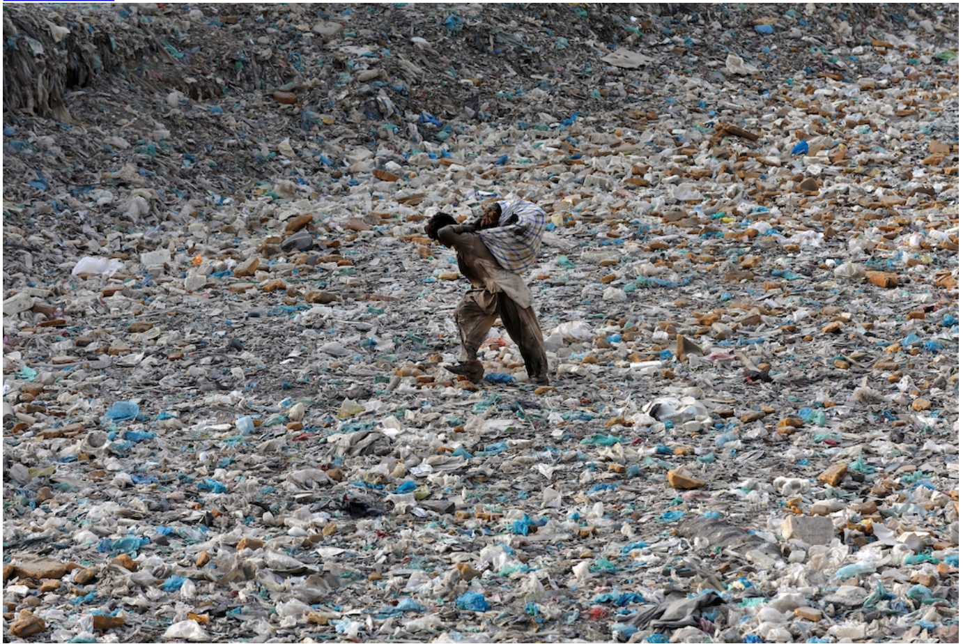
A boy carrying a sack of recyclables walks through trash in Karachi, Pakistan, June 4, 2020.