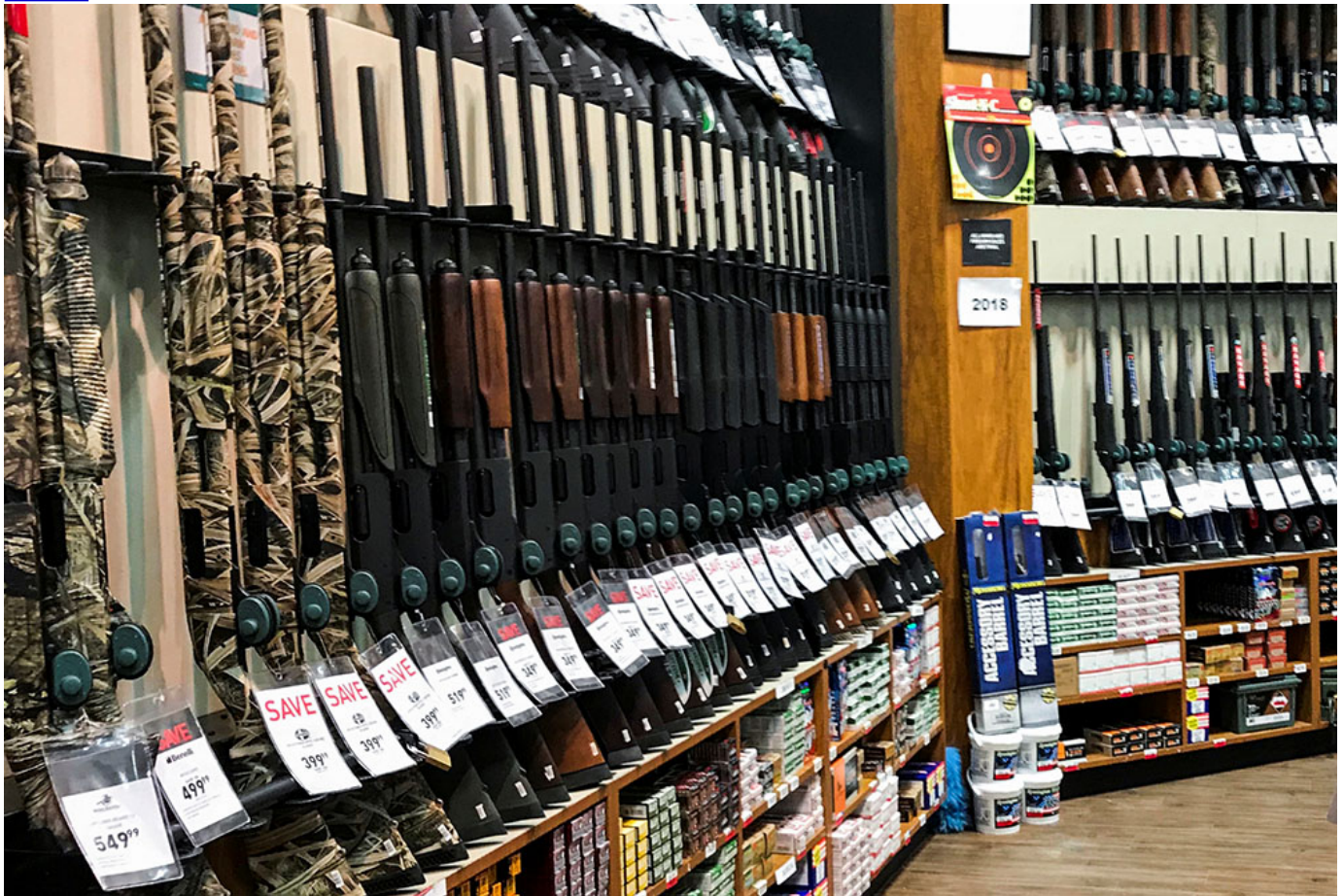
Rifles are seen inside the gun section of a sporting goods store.