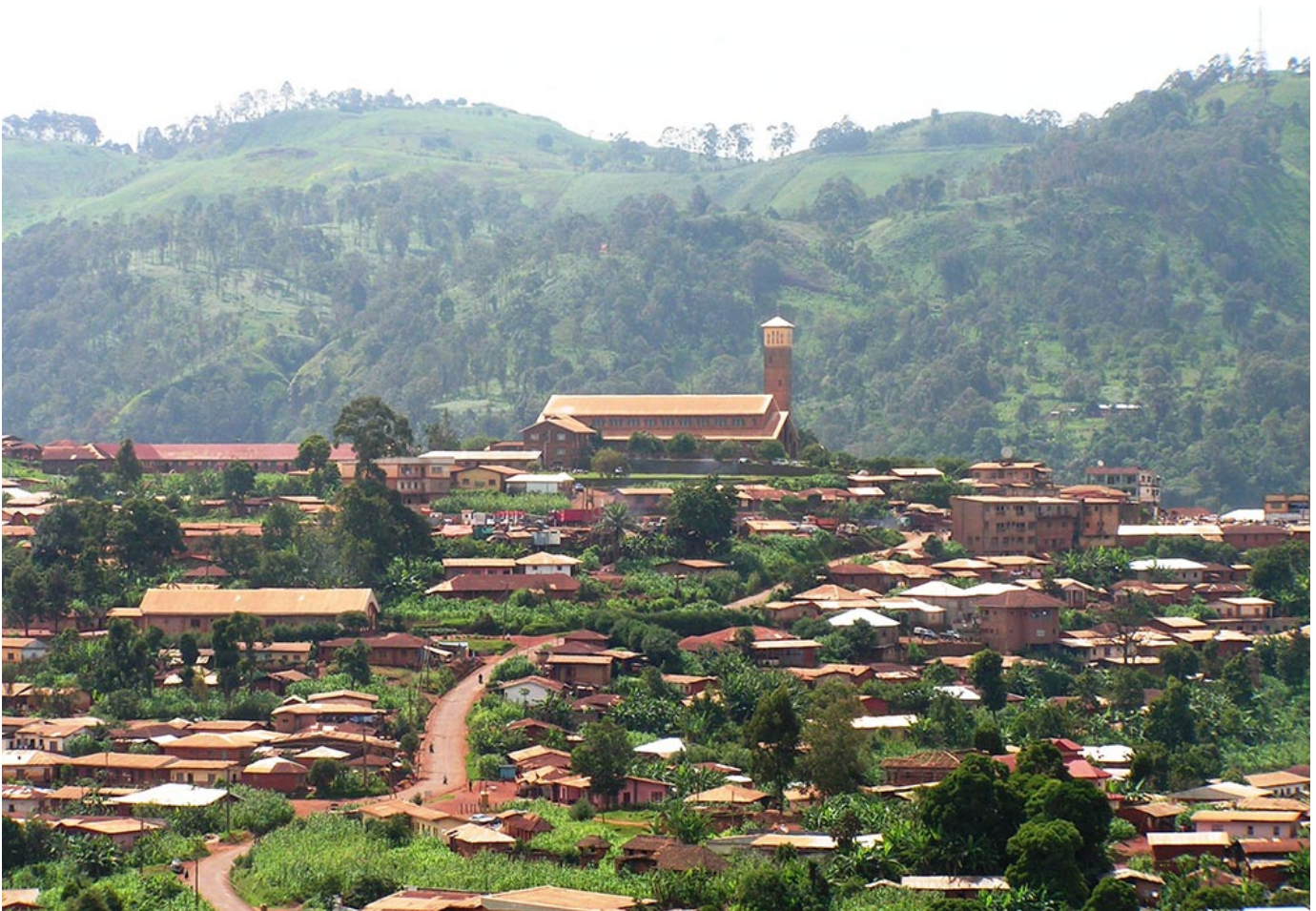
A view of the Catholic cathedral of Kumbo, in Cameroon's English-speaking Northwest Region

The two entities went into a federal structure of government, with each entity allowed to freely run its affairs in line with the systems inherited from the colonial powers. But in recent years, some people in the English-speaking regions had accused the central government of trying to quash their traditions.