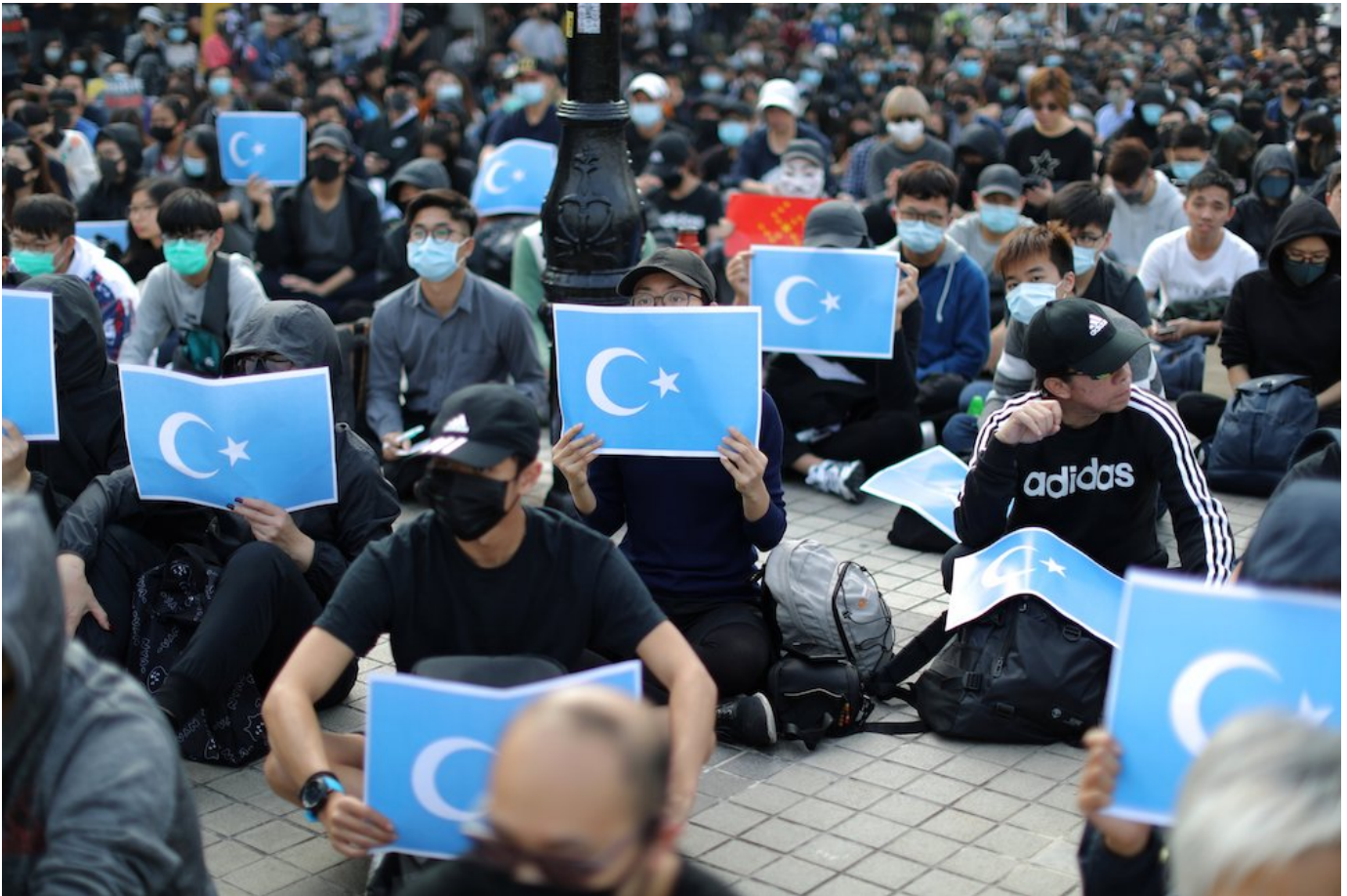
Hong Kong protesters hold East Turkestan Uighur flags at a rally in support of Xinjiang Uighurs' human rights, in Hong Kong Dec. 22, 2019.

Ahmari quickly took the tweet down. I suppose someone reminded him that Catholic conservatives are supposed to hate China because Pope Francis is trying to create an opening for the church there. For example, here is George Weigel at First Things , and Raymond Arroyo interviewing Steven Mosher about his new book The Bully of Asia . I guess Ahmari forgot about all that, at least momentarily. He subsequently deleted his tweet.