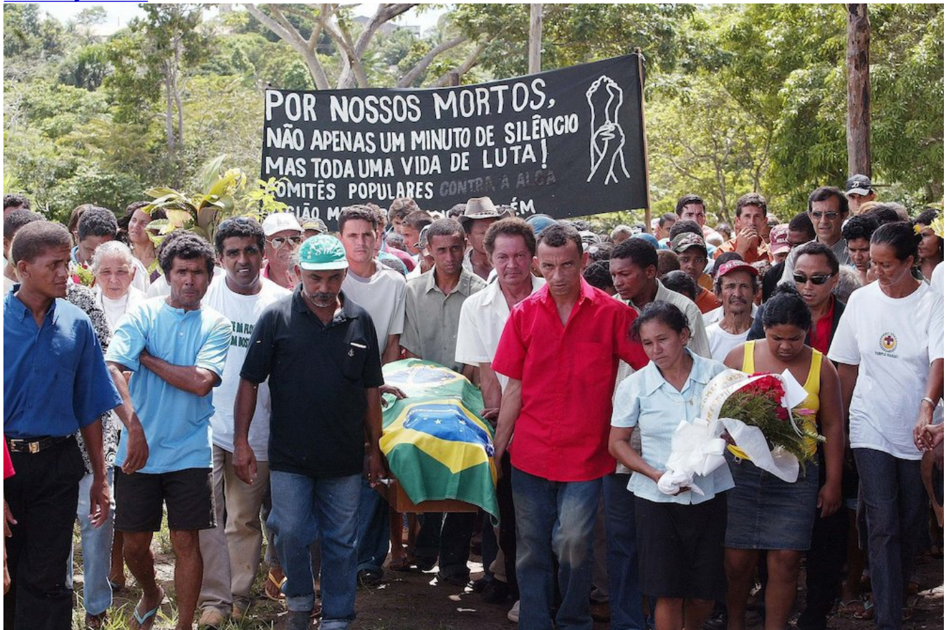
Members of the Landless Movement carry the coffin of U.S. Sr. Dorothy Stang during her funeral services Feb. 15, 2005, in Anapu, Brazil.