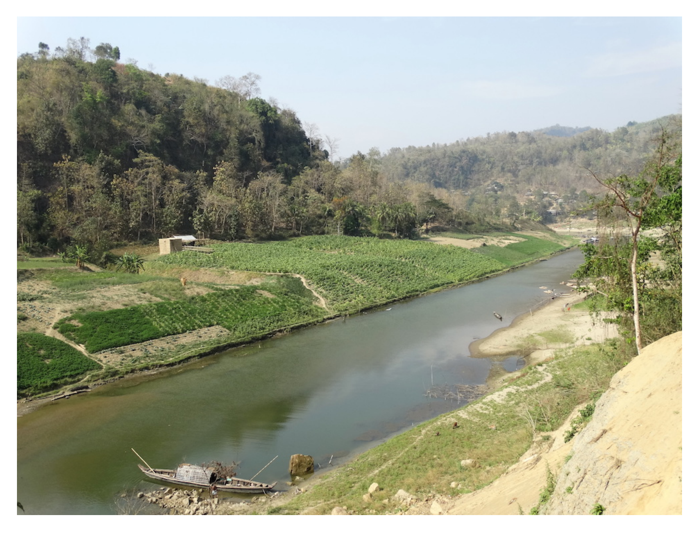
Ruma Bazar, Chittagong Hill Tracts, Bangladesh, in 2014

People worry that the projects will affect forests, water supplies, biodiversity and sacred sites. Women will suffer most, because of loss of access to water and to food from the forest, she said. Women are also the targets of violence, including sexual violence, in areas being developed for tourism.