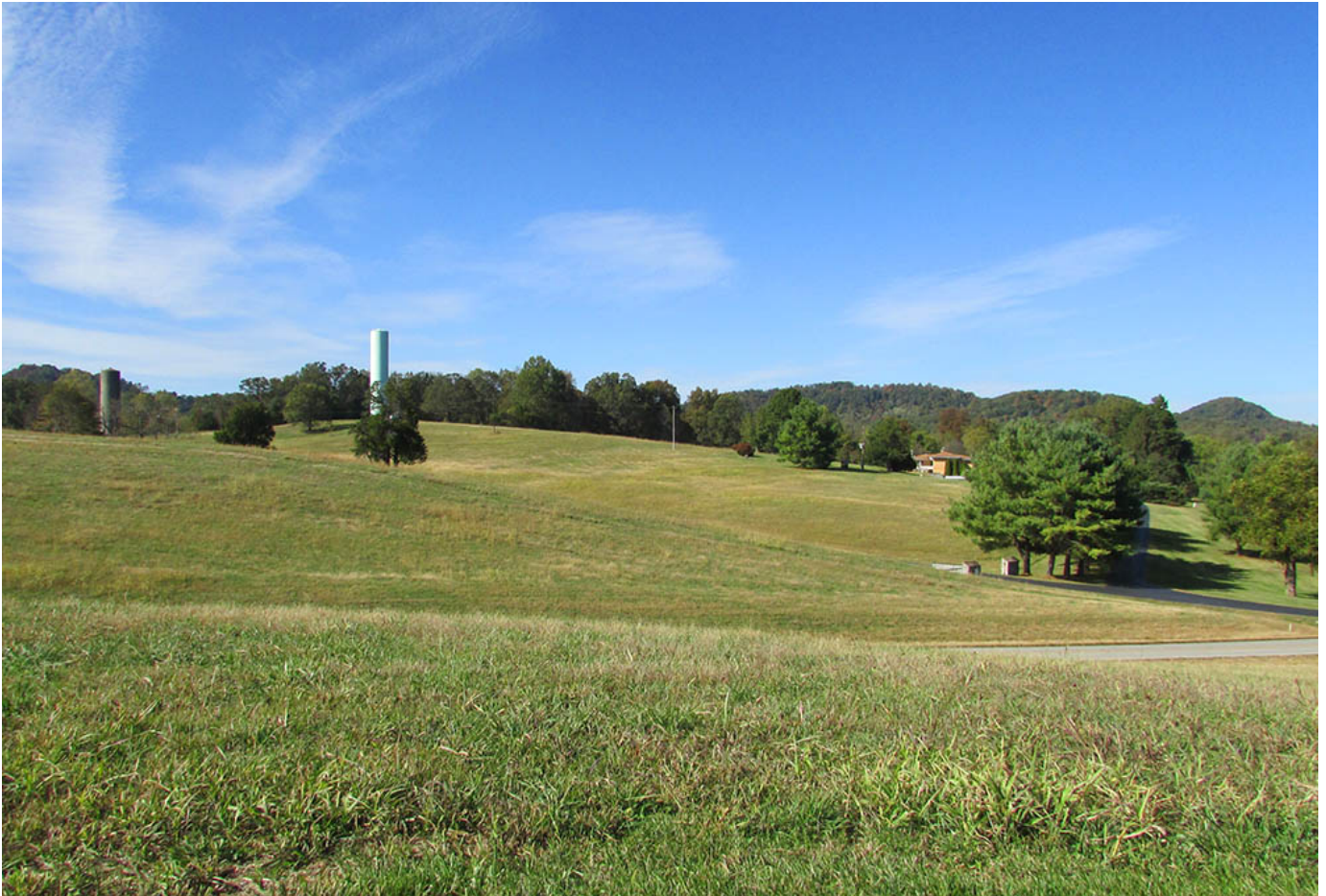
A field at the Abbey of Gethsemani, Kentucky