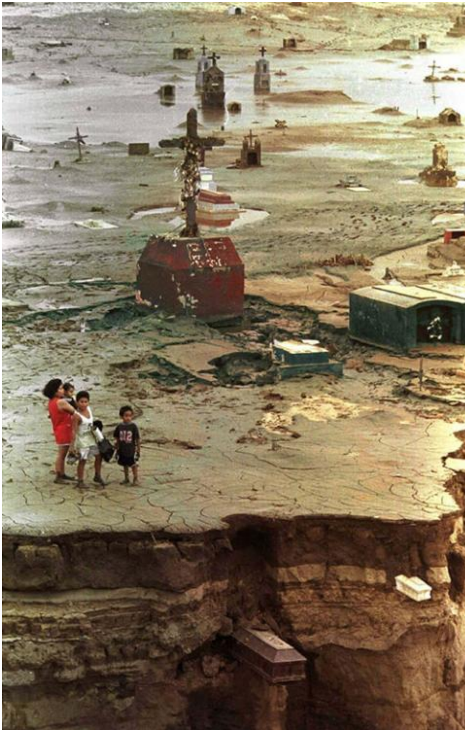
A family looks over a cemetery damaged by mudslides and flooding from El Niño rains in Trujillo, Peru, Feb. 12, 1998.

In some cases, the author writes, "religious groups take the lead in offering charity and relief to desperate populations, a function for which the state is usually