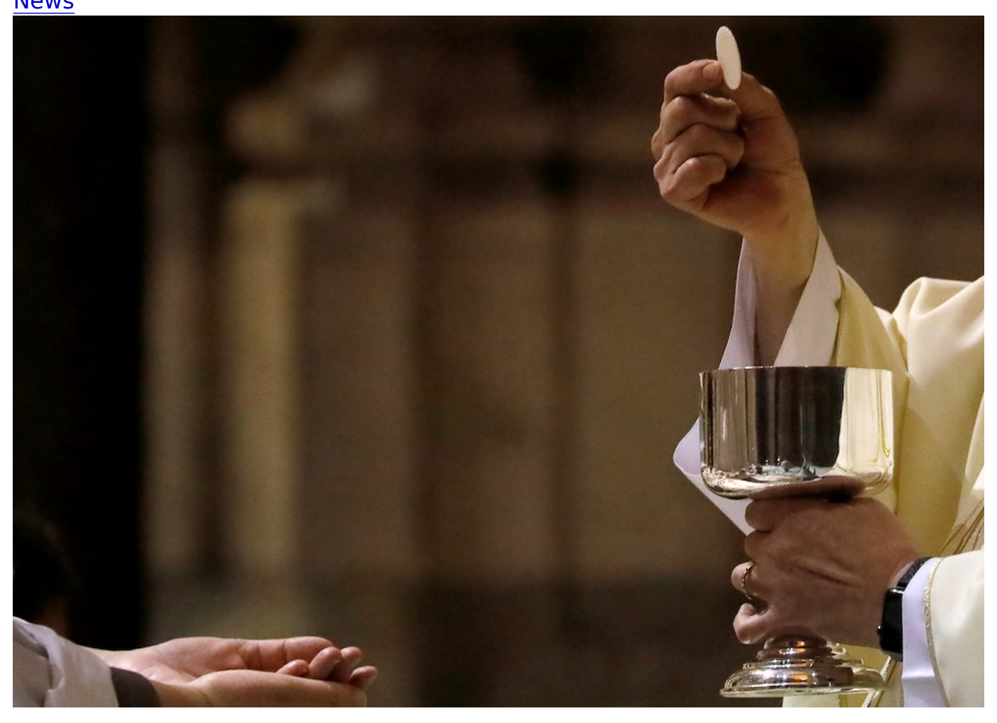
A priest distributes Communion during Mass.