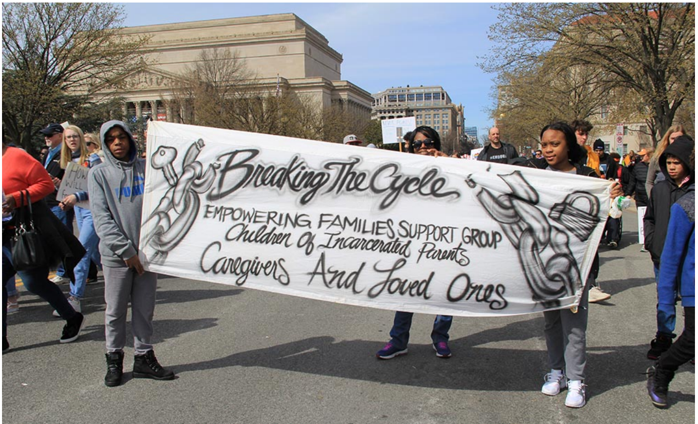
Young activists carry a banner for children of incarcerated parents during the March for Our Lives in Washington, D.C., on March 24, 2018.

For instance, although Black and white Americans use drugs at similar rates, Black people are roughly 2.7 times more likely than white people to be incarcerated for drug offenses, according to the Hamilton Project .