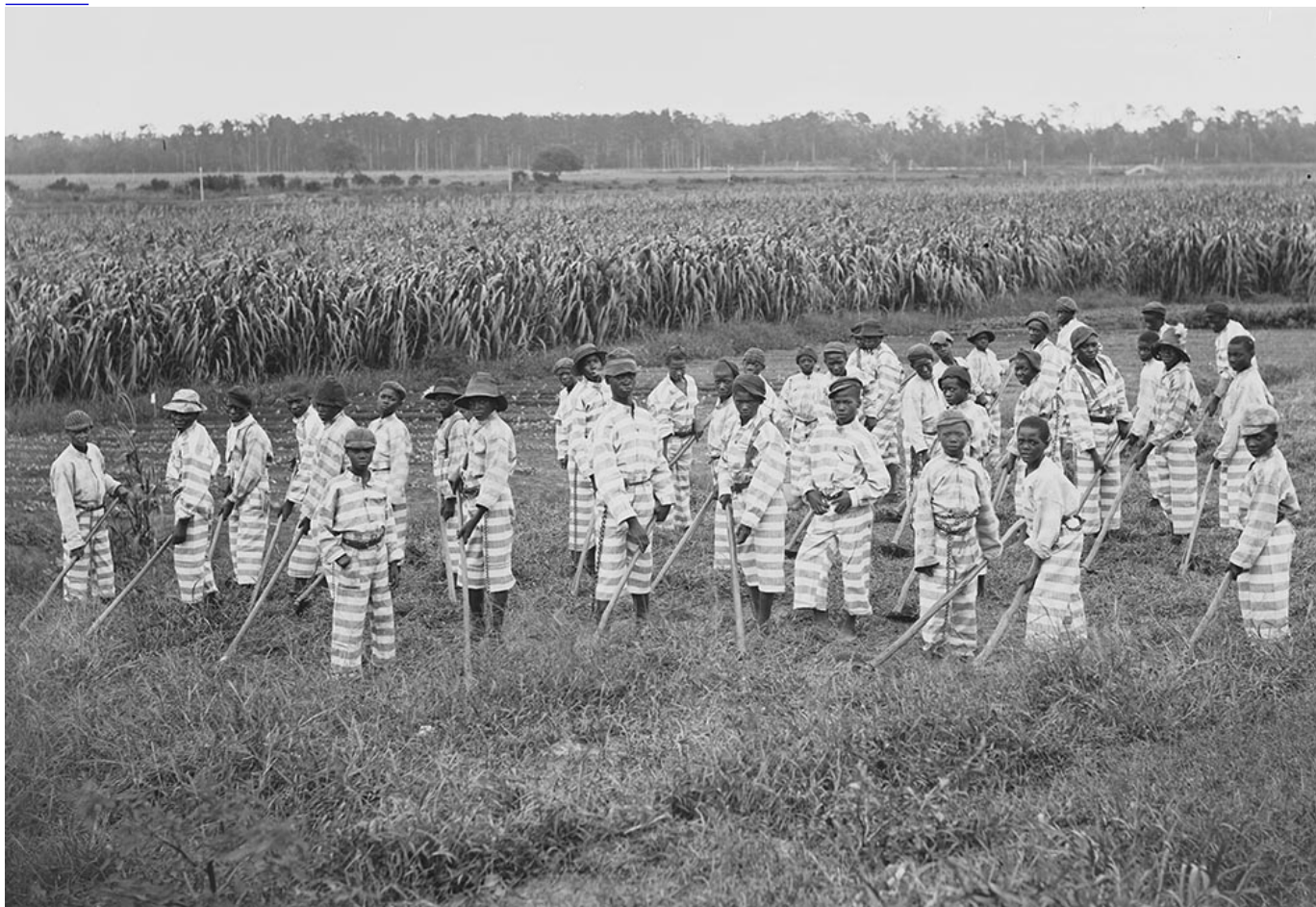
Juvenile convicts at work in fields, circa 1903