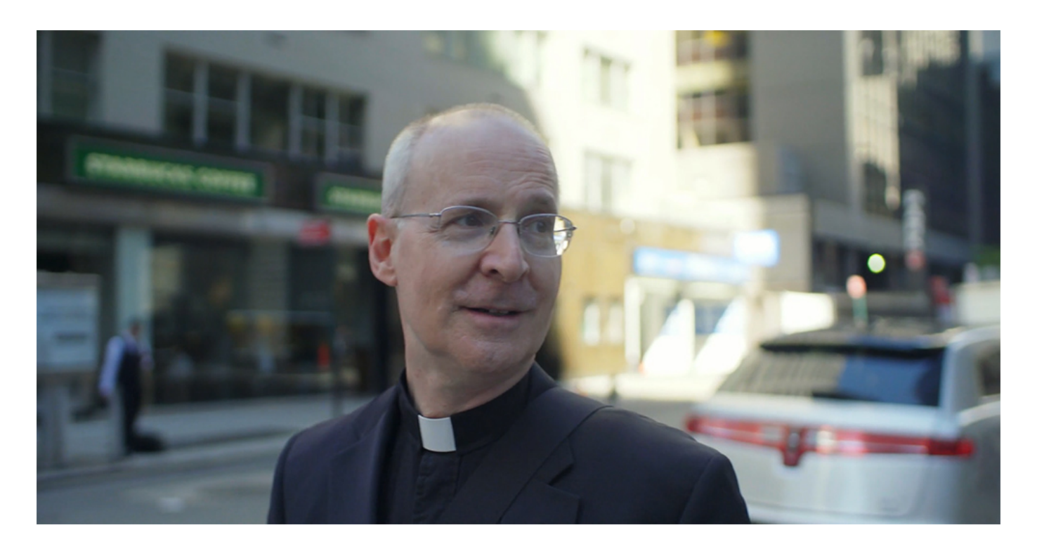
Jesuit Fr. James Martin walks through New York City in a still from the 2021 film "Building a Bridge," executive produced by Martin Scorsese.

So if it's a legitimate critique or a thoughtful question, I'll answer it, but if it's just hatred, or homophobia, then I ignore it. I don't let it in. I don't let it make a claim on me. It's just from homophobic, hateful, mean people. Some people are just mean. It has very little to do with theology. It's like schoolyard bullying.