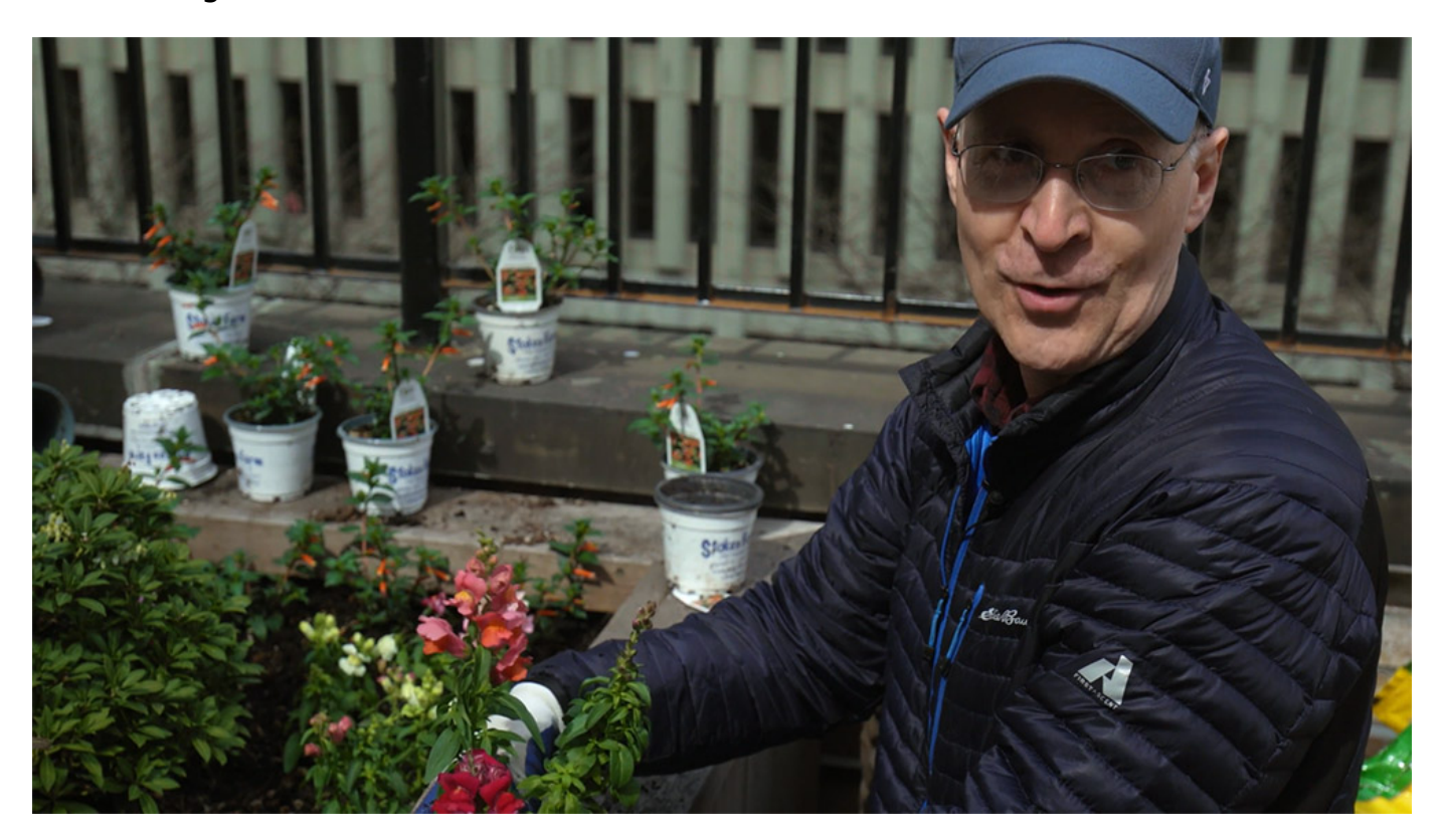
Jesuit Fr. James Martin is pictured gardening in a still from the 2021 film "Building a Bridge."

Church teaching is not just a few lines. It's Jesus' example. And in Jesus, we see someone who is consistently reaching out to people around the margins. To me, that's the most fundamental of church teachings. I think that's the one we're overlooking the most.